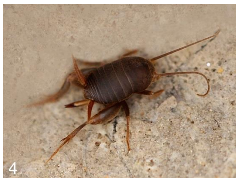
FIG. 4. Myrmecophilus hirticaudus (female), FYROM, Smrdliwa Voda, 26.07.2012.