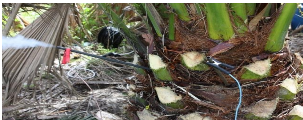
FIG 2: Electric voltage applied to the palm tree through electrodes.