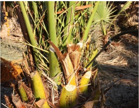
FIG. 1. Water injected inside the palm tree through the electrode.

Aim of this study was to test the efficiency of electricity as a method for controlling insects that live and feed inside palm trees. Seven infested date palms ( Ph. canariensis ) were selected for the experiment. Their height ranged from 1 to 1.5m.