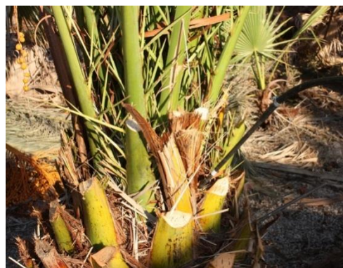
FIG. 1. Water injected inside the palm tree through the electrode.