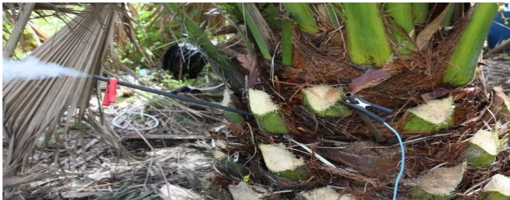
FIG 2: Electric voltage applied to the palm tree through electrodes.