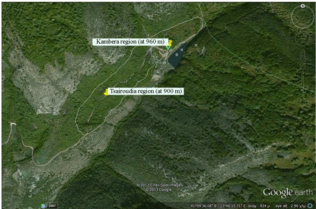
FIG. 1 .The sampling areas (Tsairoudia and Kambara) on MountMenoikio, North East Greece.