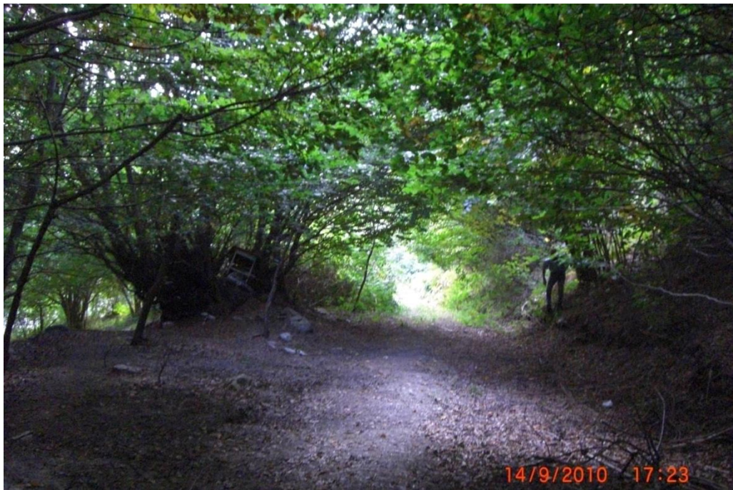
FIG. 2. Forest of hazel trees in Tsairoudia area.