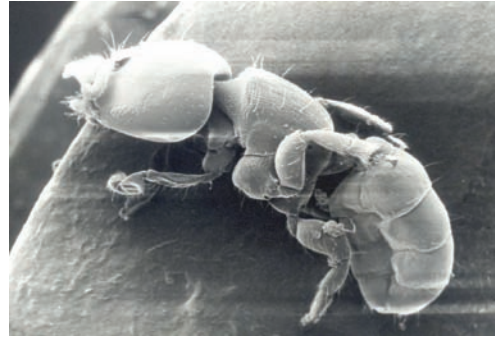
FIG. 1. Scanning electron microscope (SEM) micrograph of worker of M. beccarii .

glands produce silk that is excreted around the hypo stoma, corresponding to the only known case of silk production by adult ants (Fisher and Robertson 1999). The modified protarsi of their forelegs are used to pull and spin the silk to line and plug the galleries. (3) Within the galleries, Melissotarsus workers tend live populations of armoured scale insects (Hemiptera: Coccoidea: Diaspididae) (Fig. 4) (Delage-Darchen et al. 1972, Prins et al. 1975, Ben-Dov 1990, Mony et al. 2007)