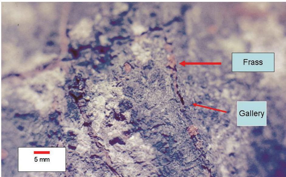
FIG. 2. External surface of bark of L. praemorsum infested with tunnels of M. beccarii .