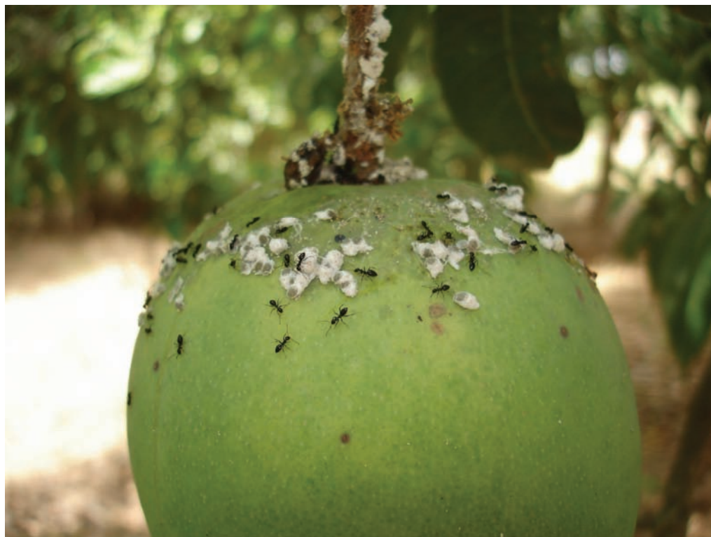
FIG. 1. Paracoccus interceptus on mango fruit.

Hosts: developing on 17 botanical families including mango ( Mangifera indica ) from India. Not known as a pest.