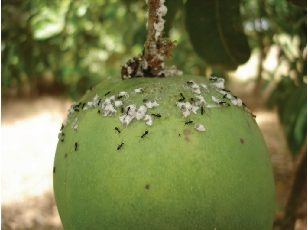
FIG. 1. Paracoccus interceptus on mango fruit.

Hosts: developing on 17 botanical families including mango ( Mangifera indica ) from India. Not known as a pest.