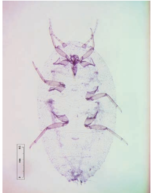
FIG. 1. Microscopic permanent slide of adult female of Phenacoccus peruvianus .

Mealybug specimens were collected from diverse host plants of Portugal, Spain, France, Italy and UK. Samples were slide-mounted (Fig. 1) according to the procedure detailed by Williams and Granara de Willink (1992) with a few modifications made by the different authors depending on their own preferences. Specimens were identified using the keys of Granara de Willink and Szumick (2007). Communication between European specialists was entailed during the identification process.