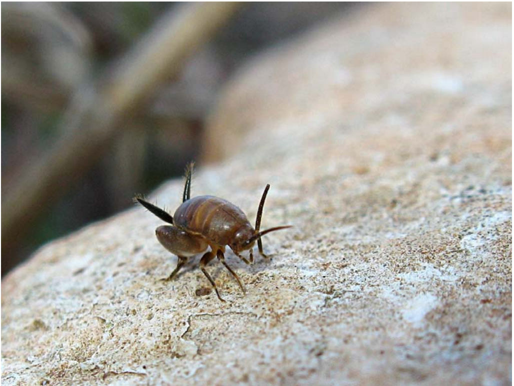
FIG. 2. Myrmecophilus ochraceus , female. 8 October 2009, Zakynthos, Greece.