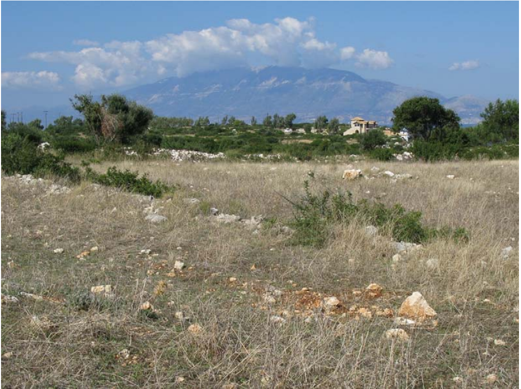
FIG. 1. Habitat of Myrmecophilus ochraceus , female. 8 October 2009, Zakynthos, Greece.

specimen from there is in the collection of the Muséum d' Histoire Naturelle à Geneve, Switzerland, own obs.), Crete (Schimmer 1909; one female collected by Raffael Aye in 1997), Rhodes (Harz 1969), Kos (Baccetti 1992), Tilos (Baccetti 1992) and Chalki (Baccetti 1992).