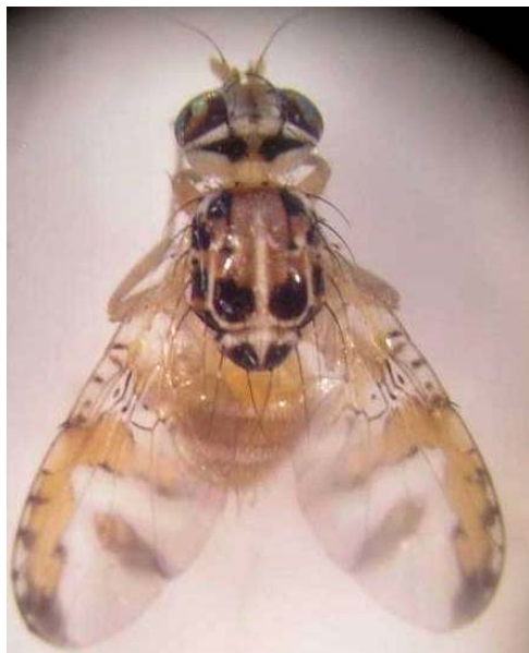
FIG. 1. Adult of C. savastani .

Mediterranean region and is also reported in Pakistan. The presence of the insect have been reported from Italy (Sicily), Malta, Algeria, Libya, Egypt, Israel, Oman, France, Pakistan, and Tunisia (Freidberg and Kugler 1989, Donati and Belcari 2003, De Meyer and Freidberg 2005, Miranda et al. 2008). This is the first record of the species in Greece.