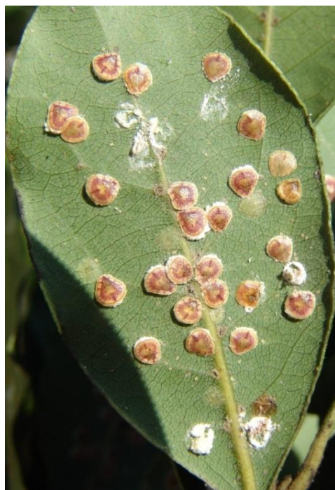
FIG. 1. Protopulvinaria pyriformis on Laurus nobilis .

It was recently recorded for the first time in Greece, on the laurel Laurus nobilis L. (Lauraceae) (Ben-Dov et al. 2003) (Fig. 1). Its phenology and ecology was studied in the area of Kalamata (Southern Peloponnesus) on L. nobilis , where it was found to complete several overlapping generations every year (Stathas et al. 2009). The duration of generation time was estimated to last ~52 days in nature during winter and it was shortened to 29-33 days during summer. It was found to be parasitized by Metaphycus helvolus (Compere) (Hymenoptera: Encyrtidae). However, the scale was able to resist parasitization by encapsulating the parasitoid's eggs. The predator Chilocorus bipustulatus (L.) (Coleoptera: Coccinellidae) was found to be the natural enemy of the scale (Stathas, et al. 2008).