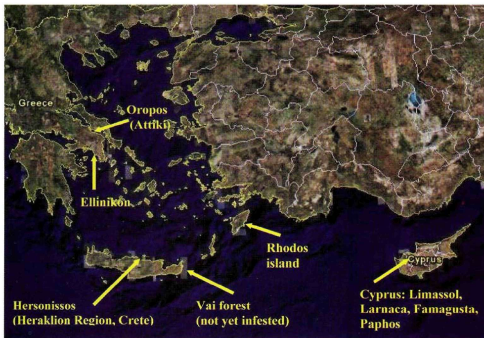
FIG. 1. Distribution of Rhynchophorus ferrugineus in Greece and Cyprus.

In Greece the infestations were mainly observed on P. canariensis that had been planted more than 10 years earlier. All infestations were observed and recorded near palm tree nurseries (<1000m) that import large quantities of palm trees. The above results are in agreement with the fact that R. ferrugineus in general is transferred by palm trees for planting. In addition, the fact that the great majority of palm trees that were found infested belongs to P. canariensis whereas, at the same time neighboring species were only found occasionally infested, implies a great susceptibility of P. canariensis . A preference in P. canariensis is indicated by the fact that other planted palm trees near the infestations (such as Ch. humilis , W. robusta , W. filifera , P. dactylifera ) were not or were occasionally infested.