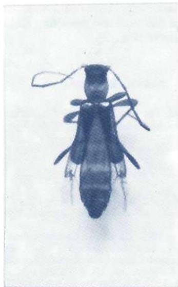
FIG. 2. Female Nathrius brevipennis (Mulsant)

N. brevipennis was described originally as Leptidea brevipennis Mulsant 1839, Coleoptera, Cerambycidae. Mulsant overlooked however that Billberg 1820 had established the same generic name Leptidea for a species of the family Pieridae (Lepidoptera). According to the rules of nomenclature, Mulsant could not use the above name owing to Leptidea Billberg (Paclt 1946). In addition, according to Linsey 1963, "this genus is based upon a single anomalous species which has been distributed by commerce to various parts of the world and renamed several times as a result". Thus, the genus has today the name Nathrius Brethes 1916. As synonyms of this insect have been