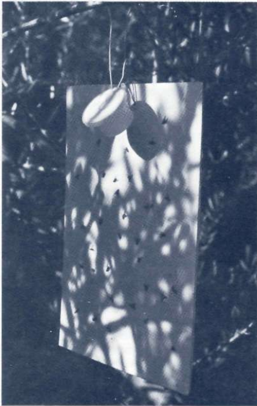
FIG. 1. Yellow sticky panel with ammonium acetate slow-release dispenser and olive fruit flies trapped.

14×20 cm cardboard rectangle coated with sticky material (Stickem Special, a product of Michel and Pelton Co. St. Emeryville, California) and ammonium acetate dispenser (Biolure, a product of Bend Research Inc. Bend, Oregon) (Fig. 1), 2) Y = as above, but without an ammonium acetate dispenser, 3) MB = McPhail glass trap baited with 200-250 cc of 2% Buminal odor lure (a product of Fino-Werke H. Luthlem Söhne Gm BH and Co. Andernach/Rhein, W. Germany) water solution, 4) ME = as above, but with a 2% Entomozyl odor lure (a product of Hoechst Hellas Co. Athens, Greece), and 5) MAS = as above, but with a 2% ammonium sulfate salt odor lure. Traps 4 and 5 are routinely used for olive fruit fly monitoring in Greece. Borax (at 1.5%) is often added in the McPhail traps to preserve trapped flies, especially in summer. The addition of borax was often found to increase trap catches slightly. It was not used in the present experiment, since practically no difference was found between ME and MEB (with borax) traps in a recent experiment in the same locale (Economopoulos and Papadopoulou 1984).