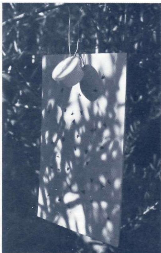
FIG. 1. Yellow sticky panel with ammonium acetate slow-release dispenser and olive fruit flies trapped.

14×20 cm cardboard rectangle coated with sticky material (Stickem Special, a product of Michel and Pelton Co. St. Emeryville, California) and ammonium acetate dispenser (Biolure, a product of Bend Research Inc. Bend, Oregon) (Fig. 1), 2) Y = as above, but without an ammonium acetate dispenser, 3) MB = McPhail glass trap baited with 200-250 cc of 2% Buminal odor lure (a product of Fino-Werke H. Luithlem Söhne Gm BH and Co. Andernach/Rhein, W. Germany) water solution, 4) ME = as above, but with a 2% Entomozyl odor lure (a product of Hoechst Hellas Co. Athens, Greece), and 5) MAS = as above, but with a 2% ammonium sulfate salt odor lure. Traps 4 and 5 are routinely used for olive fruit fly monitoring in Greece. Borax (at 1.5%) is often added in the McPhail traps to preserve trapped flies, especially in summer. The addition of borax was often found to increase trap catches slightly. It was not used in the present experiment, since practically no difference was found between ME and MEB (with borax) traps in a recent experiment in the same locale (Economopoulos and Papadopoulos 1984).