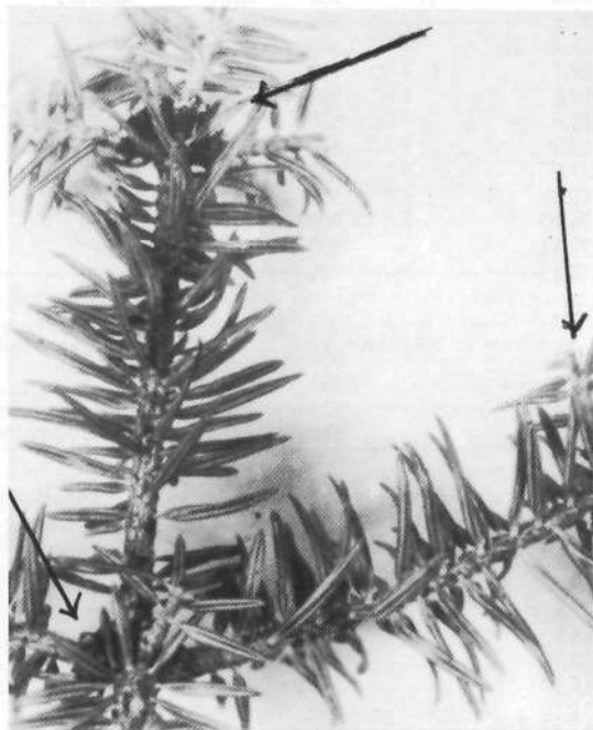
FIG. 1. Adults of P. hemicryphus at oviposition on fir forks of A. cephalonica in Mount Parnitha, June 1985.

The young adults started to oviposit early in May and till July all scales were ovipositing (Fig. 1). The number of eggs laid varied from 82 to 1,486 (Table 3). Kailidis and Georgevits (1971) reported that eggs vary from 40 to 450. According to Schmutterer (1956) the number of