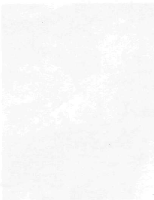
Fig. 1. Larvae of Corythucha viripes on the leaf of the plant.

The insects were collected in the island of Santorini in the spring and summer of 1970, 1971 and 1972. The collecting sites were located in the island of Santorini and in various places in the island. The insects were collected in the island of Santorini and in various places in the island.