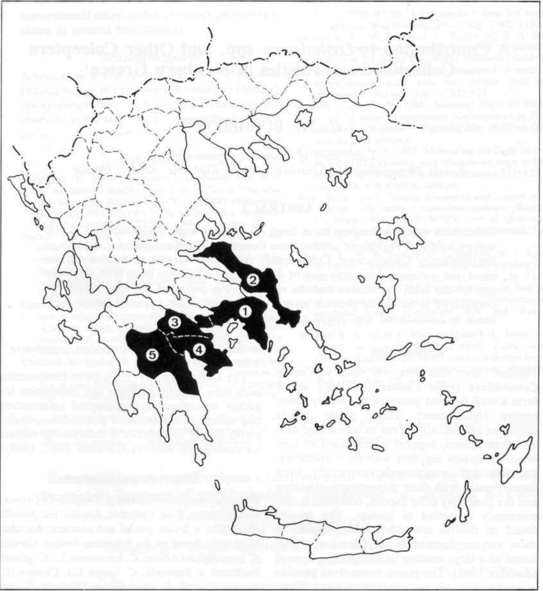
FIG. 1. Regions of Greece where the insect collection took place: 1. Attica, 2. Evia, 3. Corinthia, 4. Argolis, and 5. Arcadia.

year. Sticky traps consisting of white paper strips 30×8 cm, adhesive on both sides ("Lasiotrap" B.A.T., West Germany) were hanged firmly in upright position at about 1 m high from the ground level, preferably in places protected from sun and rain, in or next to sites occupied by thistles. To lure Lasioderma adults, a pheromone (2,6 - diethyl - 3, 5 dimethyl - 3, 4 - dihydro - 2H - pyran = anhydro - rricomin) in pervious dispenser (capsule)