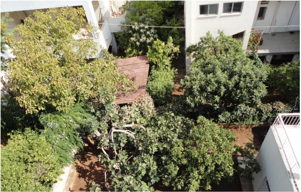
FIG. 2. Partial view of the experimental and neighboring back-yards. Fig, loquat, mandarin, lemon and orange fruit trees, planted at short distances, can be seen.

McPhail yellow bottom traps were suspended on 12 November 2015 and were inspected weekly till 23 November 2016, except for the period December through March when due to the cold weather and absence of considerable numbers of adult flies, trap inspection was conducted less frequently. One trap was suspended per host tree. Traps were initially (November 2015) suspended in the 2 navel and the 2 mandarin trees, in mid-April traps were also suspended in the 2 lemon and the orange tree cultivar with seeds, while the trap in the fig tree was suspended in mid-June, i.e. about one month before the first figs mature. The yellow lower part of the trap was filled with ~250 ml tap-water and a few drops of kitchen detergent. From June till November 1.5 % borax (sodium tetraborate 10-hydrate) was added into the water to preserve trapped insects in good condition. On the inside of the upper transparent part of the trap the 3 separate Biolure dispensers were stuck: ammonium acetate, putrescine (1.4 diaminobutane), and trimethylamine (Heath