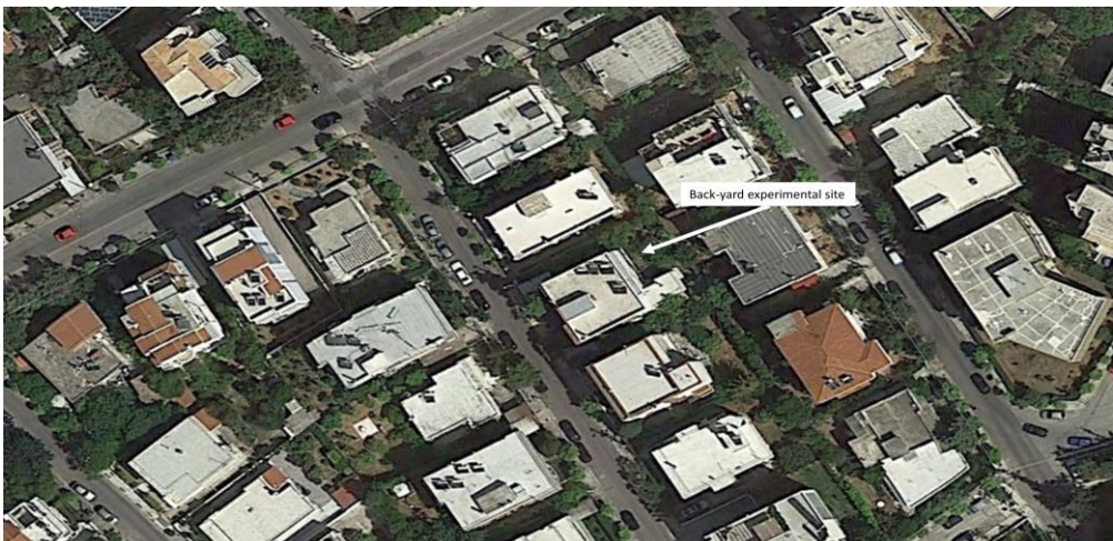
FIG. 1. Typical suburban area in southern Mediterranean Europe. The suburb shown, Papagos, is located 7 km from the center of Athens, capital city of Greece. The small experimental back-yard contains 8 medfly-host fruit trees in total.

over the whole of Southern Mediterranean Europe. Often, there is a continuum from back-yards to major commercial plantations. Back-yards usually contain several different medfly host trees, which means continuous medfly population growth throughout the year, as compared to commercial plantations composed of only one host-tree species or cultivar. No insecticidal treatments are usually applied in back-yards due to the immediate household proximity. The experimental back-yard used (Figs. 1 and 2) is located in Papagos municipality, 7 km north-east of the center of Athens, north latitude 38°. It contains 8 medfly host trees, 1 pine tree and ornamental plants. The host trees are: 3 orange (of which the two are navel oranges and the other an old cultivar of late maturation with many seeds in the fruit), 2 lemon, 2 mandarin (one with seeds and the other a seedless cultivar) and a fig tree. Similar host trees are found in the neighboring back-yards as well as apricot, loquat and pomegranate host trees. Plantation distances are usually very short between trees or between trees and buildings, with tree canopies often intermixing.