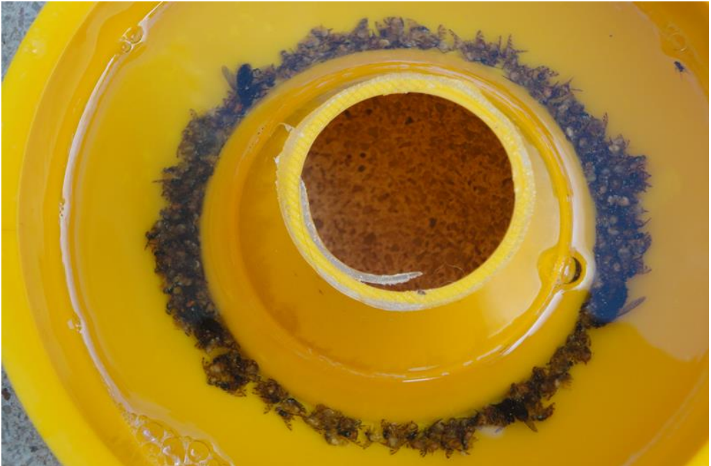
FIG. 4. Medflies captured in the trap suspended in a rather big navel orange tree within one week, October 5-12, 2016: in total 220 female and 24 male medflies. Only 2 houseflies and no other non-target insect species were detected in the trap in the specific period.

September to 5 October (356 females and 92 males). In the much higher peak of trapped medflies of June-July, 648 total medflies were caught in the same trap during 18-25 June, and 592 total medflies were caught during 30 June to 7 July. In the photo of Fig. 4, the extreme species selectivity of Biolure can be observed, i.e. only medflies can be seen in the yellow trap bottom plus 2 houseflies.