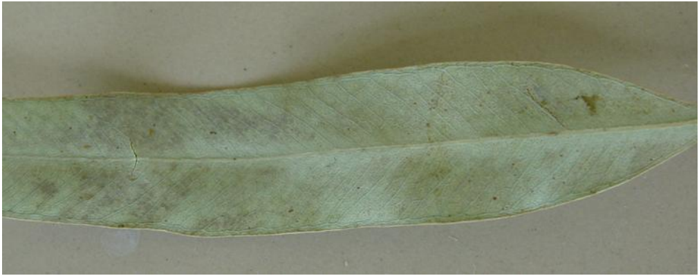
FIG. 3. The underside of the leaf blade and the associated leaf damage (chlorotic leaf areas and areas with initiation of bronzing) caused by Thaumastocoris peregrinus is shown. The leaf in a few days becomes bronze in color, hence the vernacular name of the insect ‘bronze bug’.