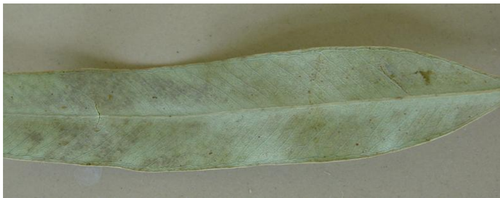
FIG. 3. The underside of the leaf blade and the associated leaf damage (chlorotic leaf areas and areas with initiation of bronzing) caused by Thaumastocoris peregrinus is shown. The leaf in a few days becomes bronze in color, hence the vernacular name of the insect ‘bronze bug’.