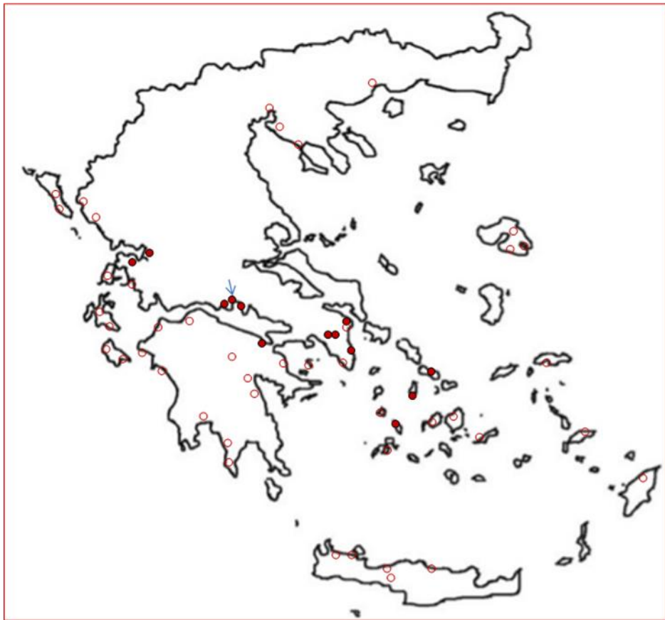
FIG. 1. Sampling sites in Greece with eucalypts. Examined sites are represented by empty circles and full circles are sites with eucalypt foliage bearing with Thaumastocoris peregrinus . A symbol may correspond to more than one site of examination. The site at Itea, Fokis where the insect was found for first time is indicated with an arrow.