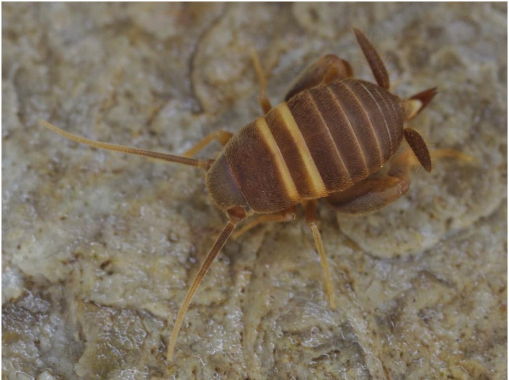
FIG. 1. Myrmecophilus acervorum , adult female. 13.05.2016, Lagnes (Vaucluse), France.