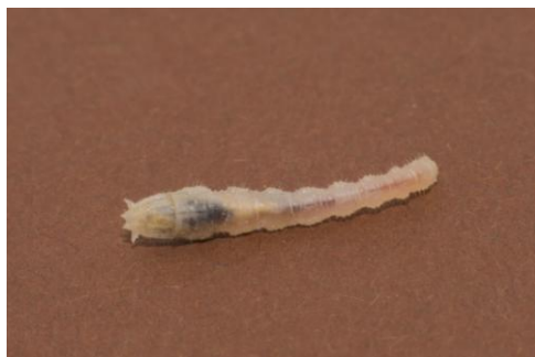
FIG. 1. Dorsal view of a late instar larva of Vermileo vermileo.

Newly-hatched wormlion larvae have an average length of 2.5 mm (Hafez and El-Moursy 1956a), while for mature ones their length can reach over 12–14 mm prior pupation (Fig. 1). The colour of the larvae is light yellowish, their body is translucent, and the alimentary canal and its content is clearly visible and recognisable. The eighth abdominal segment terminates in four conical fleshy lobes. The building of pitfall trap is performed by the head, while in the case of antlions the terminal setae of the abdomen has also an important digging role. Total developmental period of larvae is extremely long (3 to 4 years) during which several larval instars are included. The duration of the larval stage is largely influenced by the quality and quantity of nutrients, as well as by climatic conditions (Séméria 2006). Development of the wormlion pupae lasts 9–10 days, depending on temperature (Le Faucheux 1961).