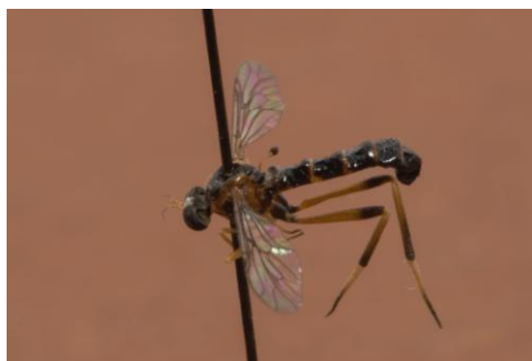
FIG. 2. Lateral view of a female adult, Vermileo vermileo.

be seen. On the mesonotum, three longitudinal blackish-brownish stripes are characteristic. The abdomen of the male is slenderer than that of the female (Nagatomi and Iwata 1976), and bulkier at the end. The pedicel of the halteres is yellow, while its clubby capitulum is dark brown. The wings are vitreous and strongly iridescent (Séguy 1926). The males are generally smaller and slenderer than females; their body length is 6–7 mm, while that of the females is 7–9 mm. The wing expanse at males is usually 9.8–10.7 mm, while in the case of females is 9.8–14 mm (Hafez and El-Moursy 1956b). Under laboratory conditions, emergence occurs around 9–11 am (Hafez and El-Moursy 1956b). The adults have short life span, primarily restricted to reproduction.