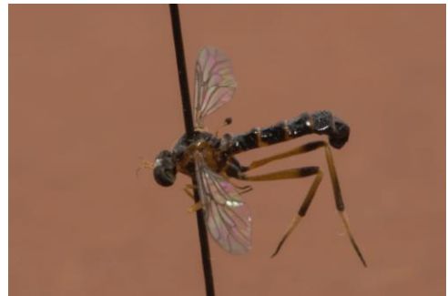
FIG. 2. Lateral view of a female adult, Vermileo vermileo.

be seen. On the mesonotum, three longitudinal blackish-brownish stripes are characteristic. The abdomen of the male is slenderer than that of the female (Nagatomi and Iwata 1976), and bulkier at the end. The pedicel of the halteres is yellow, while its clubby capitulum is dark brown. The wings are vitreous and strongly iridescent (Séguy 1926). The males are generally smaller and slenderer than females; their body length is 6–7 mm, while that of the females is 7–9 mm. The wing expanse at males is usually 9.8–10.7 mm, while in the case of females is 9.8–14 mm (Hafez and El-Moursy 1956b). Under laboratory conditions, emergence occurs around 9–11 am (Hafez and El-Moursy 1956b). The adults have short life span, primarily restricted to reproduction.