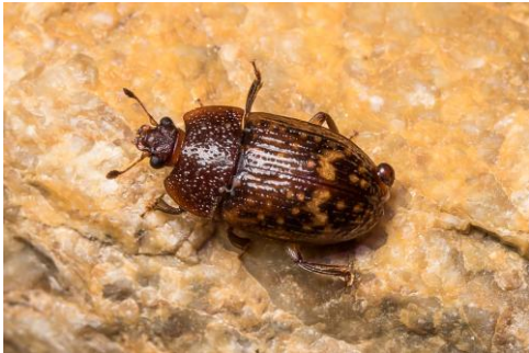
FIG. 1. Phenolia (Lasiodites) picta found in Platanidia near Mt. Pelion in Greece.

On August 30, 2018 in Platanidia, near Mt. Pelion of Central Greece, an individual of the genus Phenolia , subgenus Lasiodites , was recorded (Fig. 1). The beetle was found at night, walking on a stone, next to a stream (Fig. 2). Species identification was carried out by the authors, based on the determination key of Kirejtshuk and Kvamme (2002).