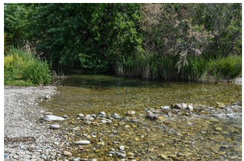
FIG. 2. The habitat in Platanidia near Mt. Pelion where P. picta was observed.

We note here that, although both P. picta and P. tibialis are known from Spain (Montagud and Orrico 2015), the specimen in the paper of Viñolas et al. (2014) about the first record of the second species in Spain, is actually and clearly P. picta . This misidentification is mentioned by Jelínek et al. (2016). Eventually, Viñolas and Muñoz-Batet (2017) documented correctly both species in Spain, with new records from Catalonia.