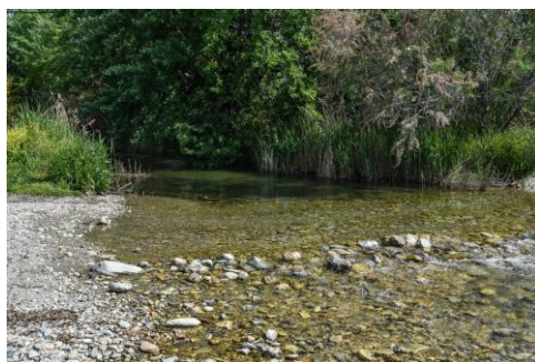
FIG. 2. The habitat in Platanidia near Mt. Pelion where P. picta was observed.

We note here that, although both P. picta and P. tibialis are known from Spain (Montagud and Orrico 2015), the specimen in the paper of Viñolas et al. (2014) about the first record of the second species in Spain, is actually and clearly P. picta . This misidentification is mentioned by Jelínek et al. (2016). Eventually, Viñolas and Muñoz-Batet (2017) documented correctly both species in Spain, with new records from Catalonia.