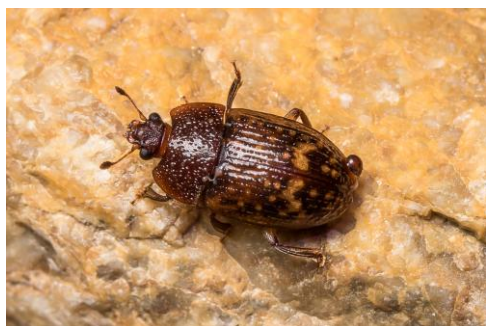
FIG. 1. Phenolia (Lasiodites) picta found in Platanidia near Mt. Pelion in Greece.

On August 30, 2018 in Platanidia, near Mt. Pelion of Central Greece, an individual of the genus Phenolia , subgenus Lasiodites , was recorded (Fig. 1). The beetle was found at night, walking on a stone, next to a stream (Fig. 2). Species identification was carried out by the authors, based on the determination key of Kirejtshuk and Kvamme (2002).