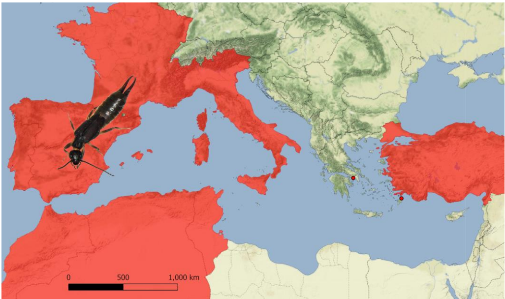
FIG. 1: Known distribution of Nala lividipes (Dufour, 1820) in the Mediterranean basin. Countries where the species has been previously reported are shaded red, while the new records from Greece are depicted with a dot. The map was created with QGIS, v.3.14.16. Inset: The adult, female individual observed on Salamis island, Greece.

anticipation of further additions. Citizen scientists have been supplementing our knowledge around the presence and distribution of alien species, providing photographic observations and specimens of new alien to the country insects such as the feather-legged fly Trichopoda pictipennis Bigot, 1876 and lantana plum moth Lantanophaga pusillidactylus (Walker, 1864) (Demetriou et al. 2020; Kazilas et al. 2020; Dios et al. 2021). Alientoma, an online database for the alien insects of Greece, promoting public participation in scientific research (Kalaentzis et al. 2021b, c), was utilised to track the presence of N. lividipes in the country. In this publication, the black field earwig N. lividipes is reported for Greece for the first time.