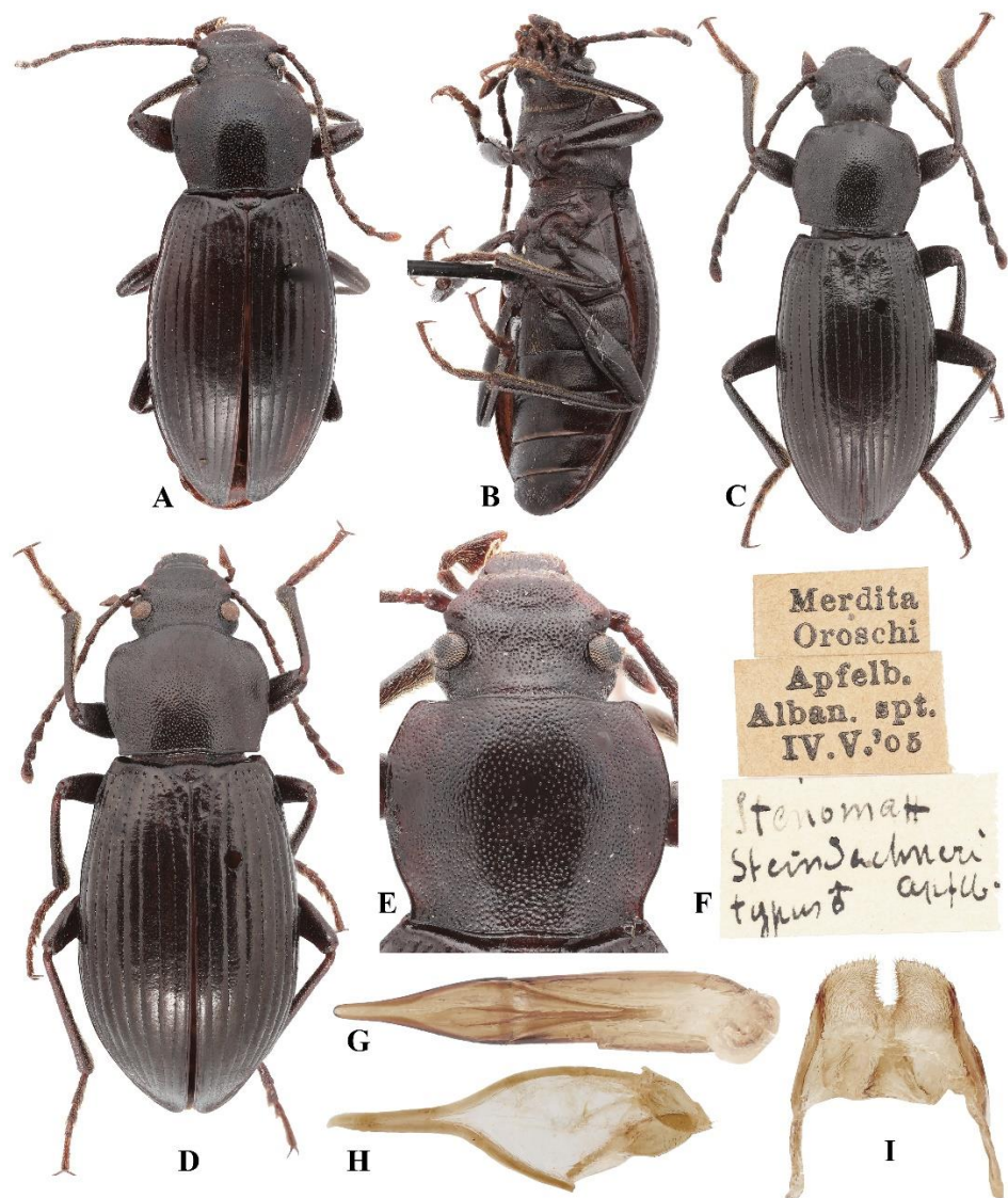
FIG. 1: Nalassus (Horistelops) steindachneri , type specimens, habitus, details, labels. A. male dorsally, lectotype; B. ditto, ventro-laterally; C. male, paralectotype, dorsally; D. female, paralectotype, dorsally; E. head and pronotum, male, lectotype; F. labels of the lectotype; G. aedeagus ventrally; H. spiculum gastrale; I. male inner sternite VIII.