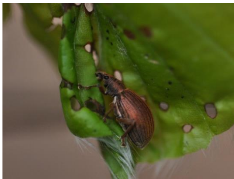
FIG. 3. Adult of Phyllobius pyri .

On hazel trees, Agriotes acuminatus Stephens and Agriotes gallicus Lacordaire (Coleoptera: Elateridae) were collected (Fig. 4). The first species, A. acuminatus , was collected on May (20 and 28) and June 8 of 2011, in hazel trees. The second species A. gallicus was collected on June 8.