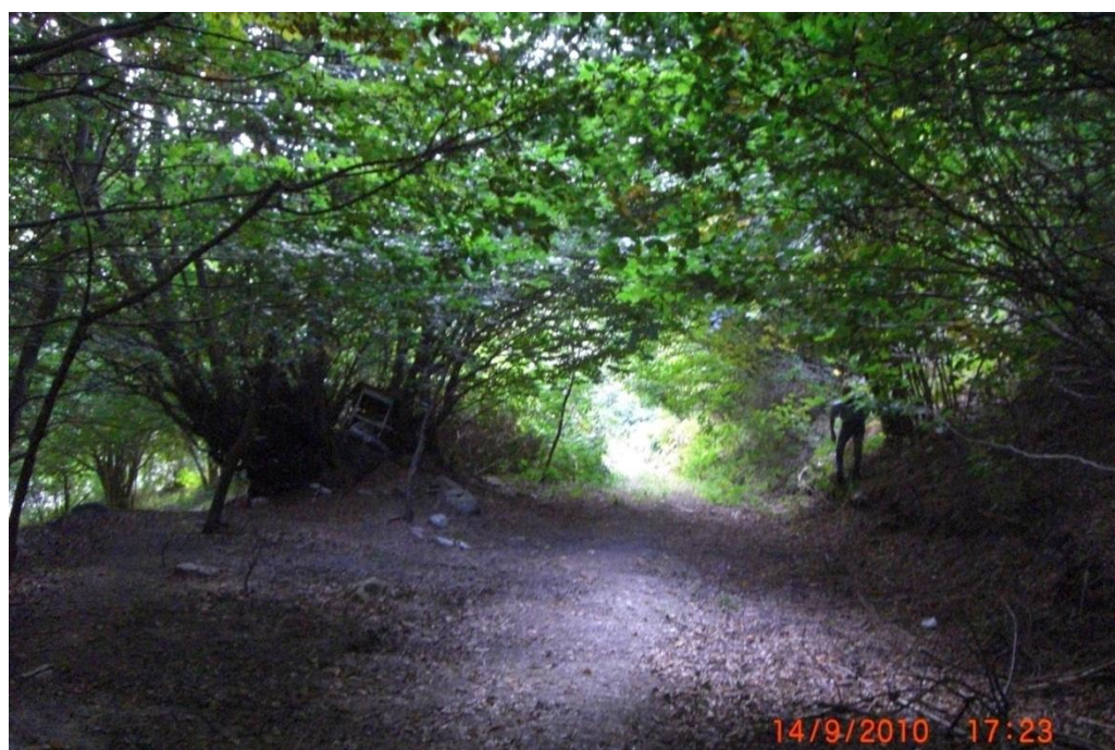
FIG. 2. Forest of hazel trees in Tsairoudia area.