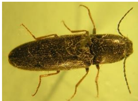
FIG. 4. Adult of Agriotes gallicus .