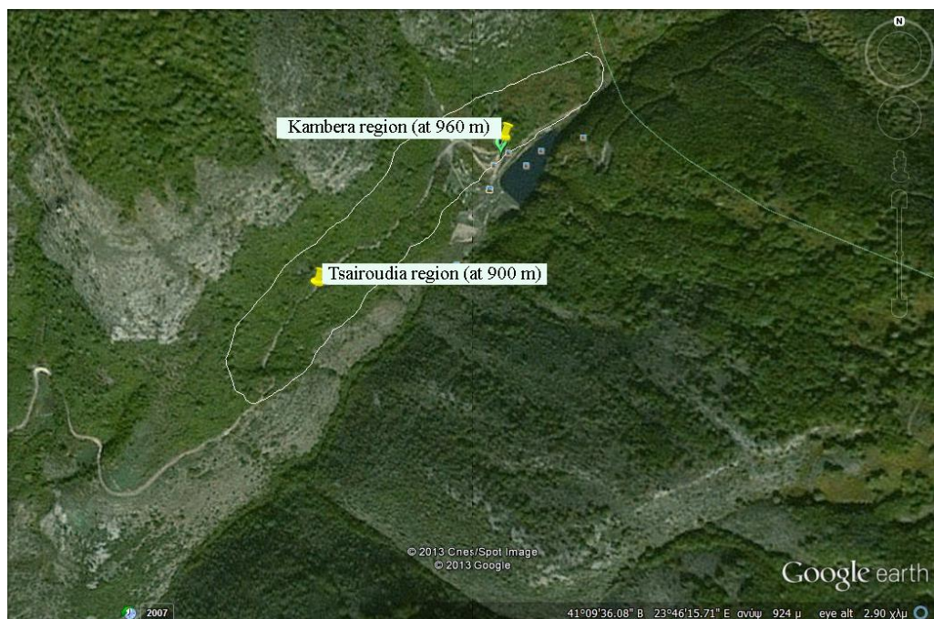
FIG. 1 .The sampling areas (Tsairoudia and Kambara) on MountMenoikio, North East Greece.