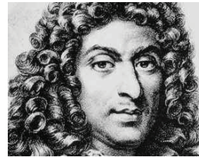
Jean-Baptiste de Lully (1632-1687).

The incident was the tip of the iceberg of a history of intense political discontent. The relations between the two states were tense because recently France had reinforced Venice by sending a military troop of thirty-one (31) ships and six thousand (6,000) men at the final phase of the siege of Candia, or “Great Castle” –nowadays Heraclion, Crete. This siege, the longest one in history, lasted a total of twenty-two (22) years. On land it was coordinated from the already conquered cities of the great island –from