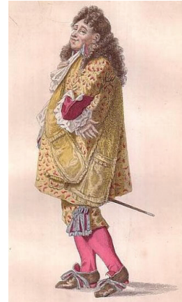
Jourdain, from Le bourgeois gentilhomme (première: 1670), engraving by L. Wolff.

Time was pressing. As it would properly suit the well-known procedural practices of exuberantly spectacle-loving Louis’ Court, all things ended up piling at the last moment within ten days: as is the standard practice in such