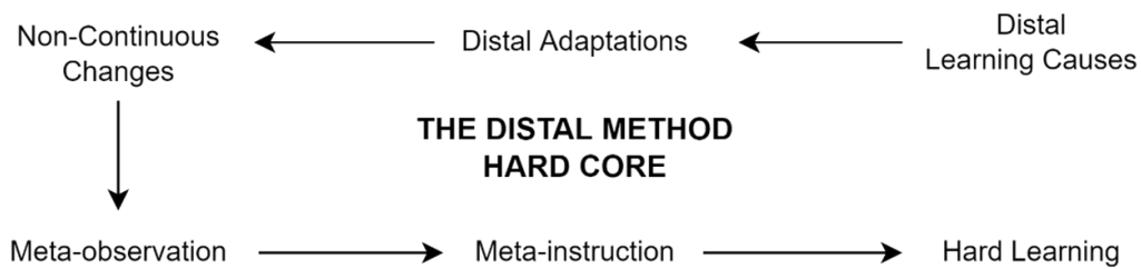
Fig. 1 The Distal Method Hard Core. DLC stands for distal learning causes, DA stands for distal adaptations, NCC stands for non continuous changes, MO stands for meta observation, MI for meta instruction and HL stands for hard learning.

tations are caused by the distal learning causes . The relation here may be described as follows: