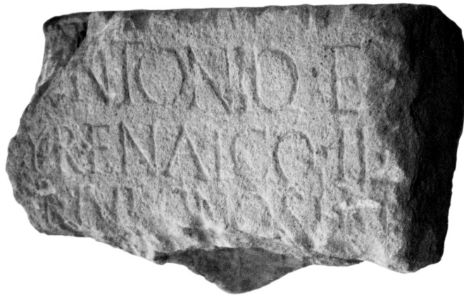
Fig. 1. [M?] Antonius E[---], Sylloge Gortynos inv. no. 394