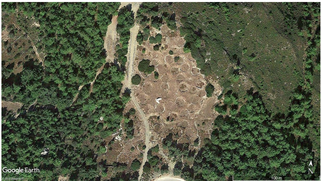
Figure 22. Site Alonia. Satellite view of threshing floors of the early 20th century.