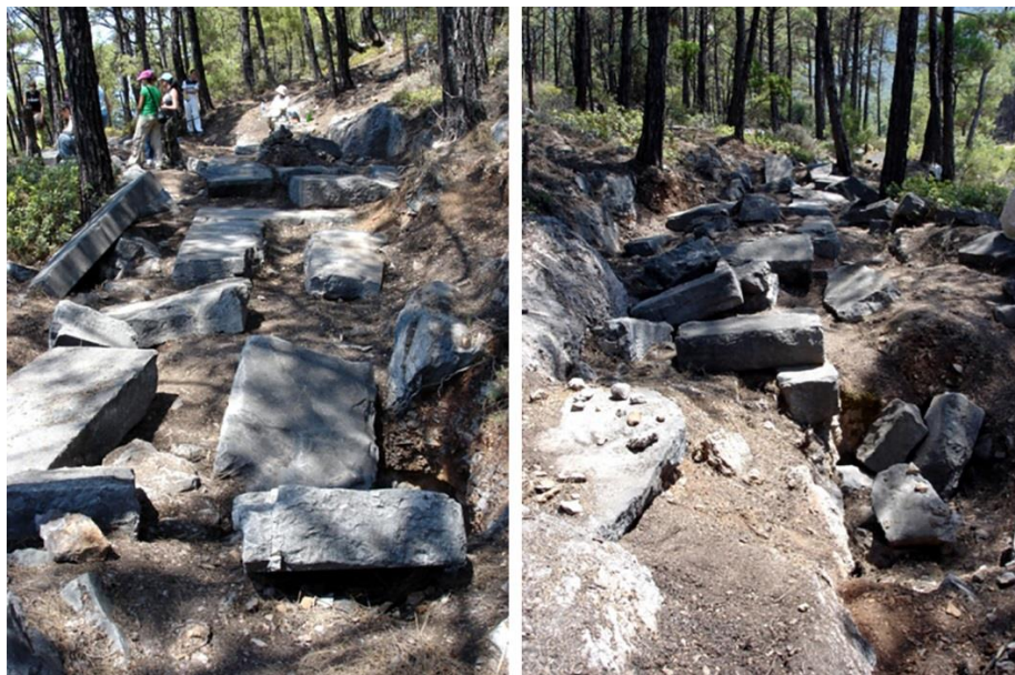
Figure 24. Site Kymissala Necropolis. Disturbed funerary monuments.