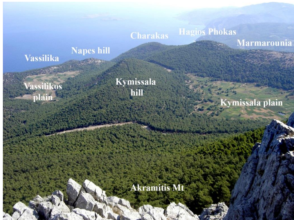
Figure 3. Kymissala. Landscape view from the south from the summit of Mt Akramitis.