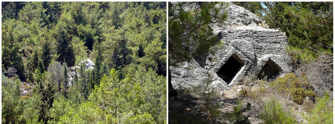
Figure 8. Site Alonia/Merouli or Koutsofti. Views of the monumental tomb from the northeast today.