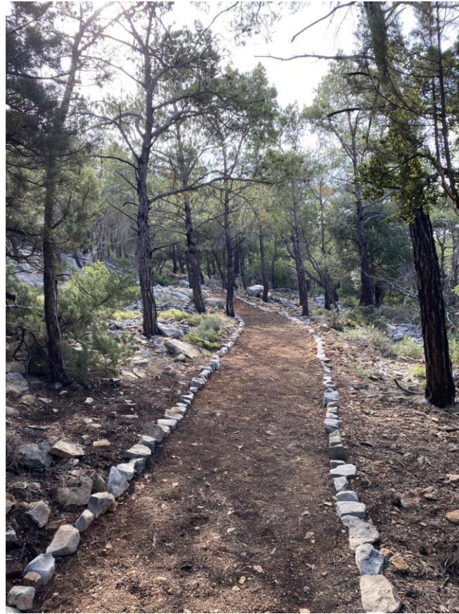
Figure 27. Part of the walking path at the west hillside of Hagios Phokas.