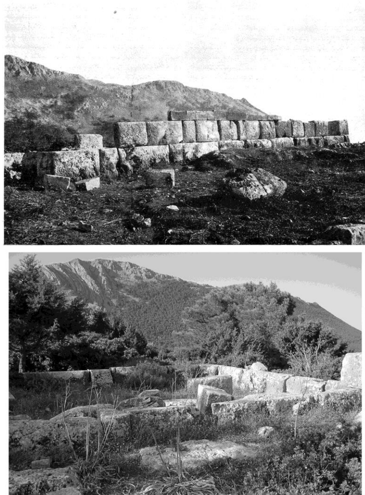
Figure 15. Site Hagios Phokas. Views of the acropolis temple in 1915 (above) (Source: Maiuri 1916, 292, fig. 9) and today (below) (Source: KARP).