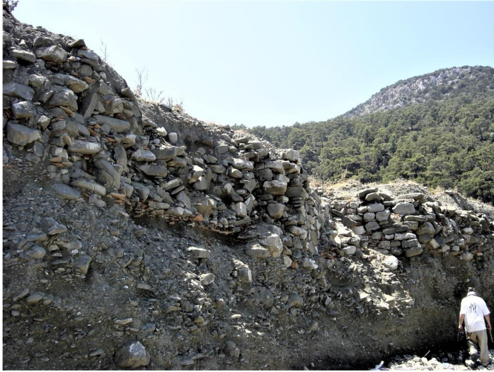
Figure 13. Site Glyphada. Remains of collapsed constructions by the shoreline.