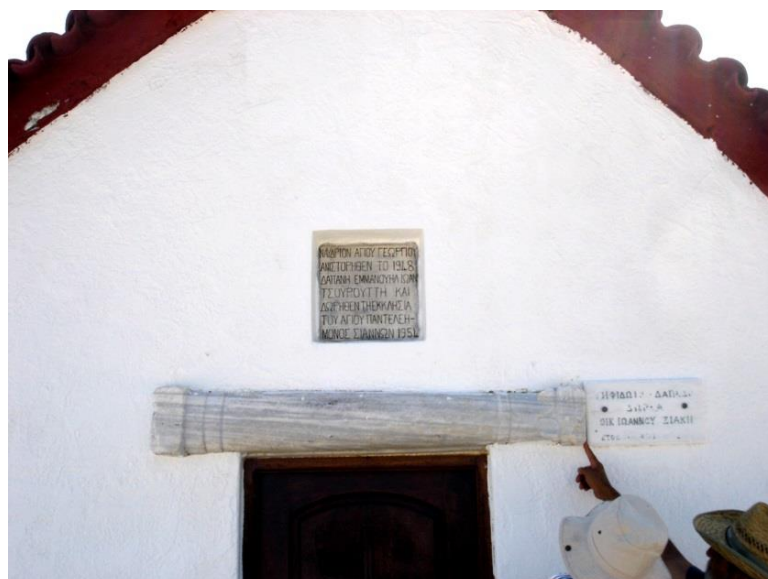
Figure 20. Site Monosyria, St Georgios' church with reused early Christian material.