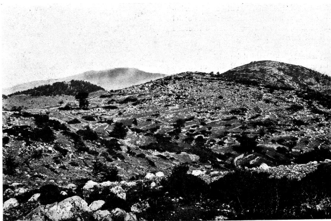
Figure 4. Kymissala. General view from the northeast in 1915 (Source: Maiuri 1916, 286, fig. 2).