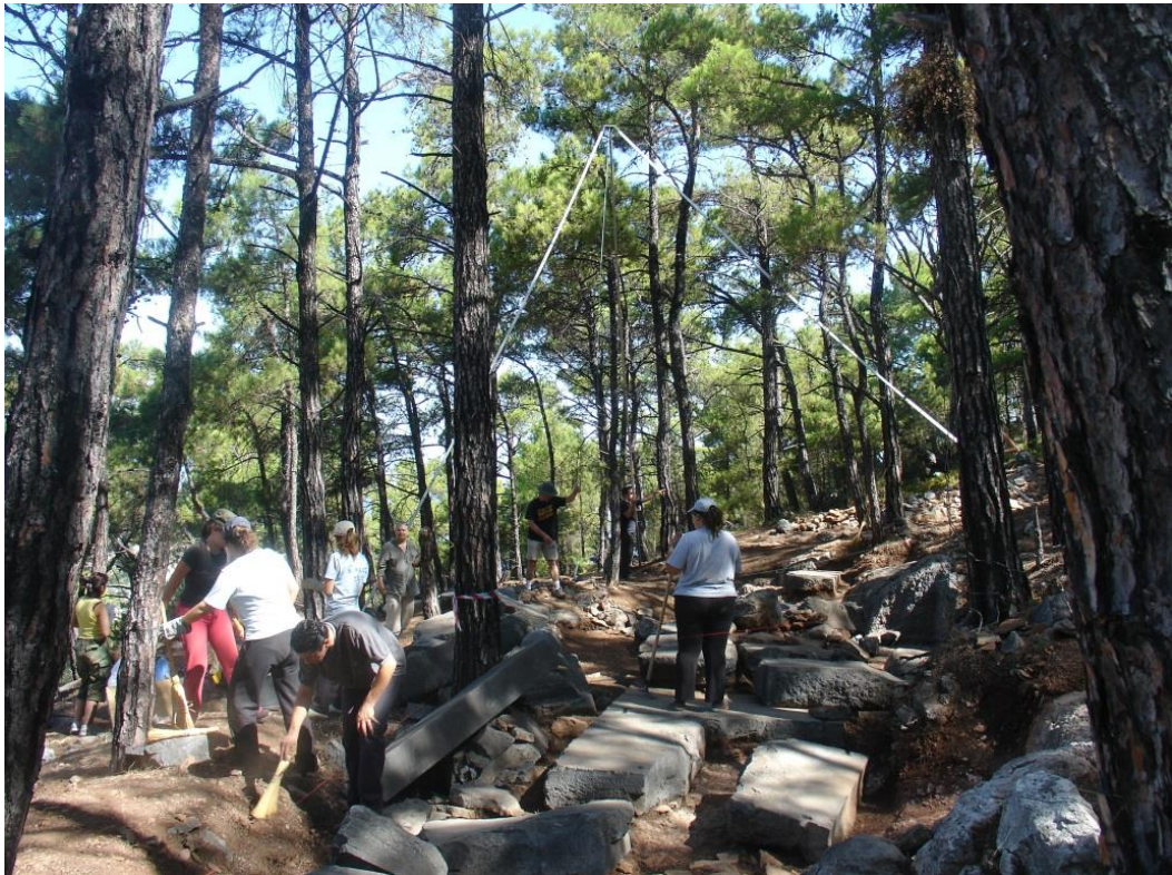
Figure 6. Site Kymissala, necropolis. Excavations in the forested east slope of the Kymissala hill (Source: KARP).