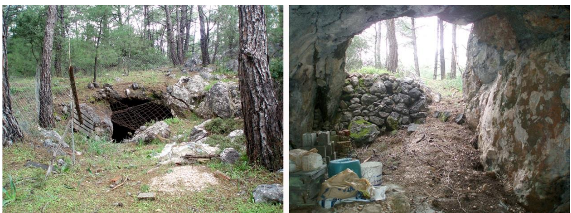
Figure 16. Site Kampanes. Chamber tomb reused for modern farming purposes.