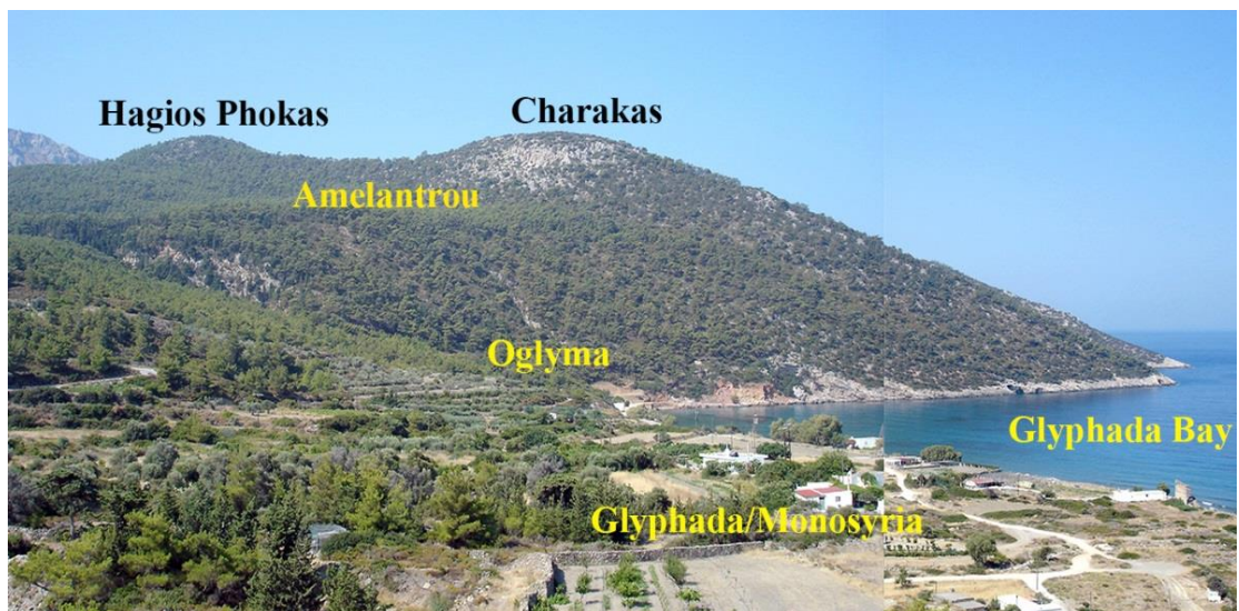
Figure 12. Glyphada. General view of the bay from the north.