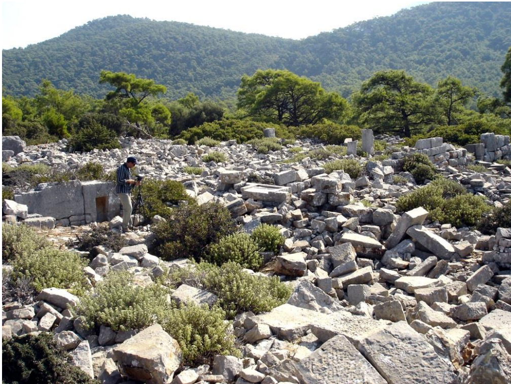
Figure 10. Site Vassilika. View of the settlement from the southwest today (Source: KARP).