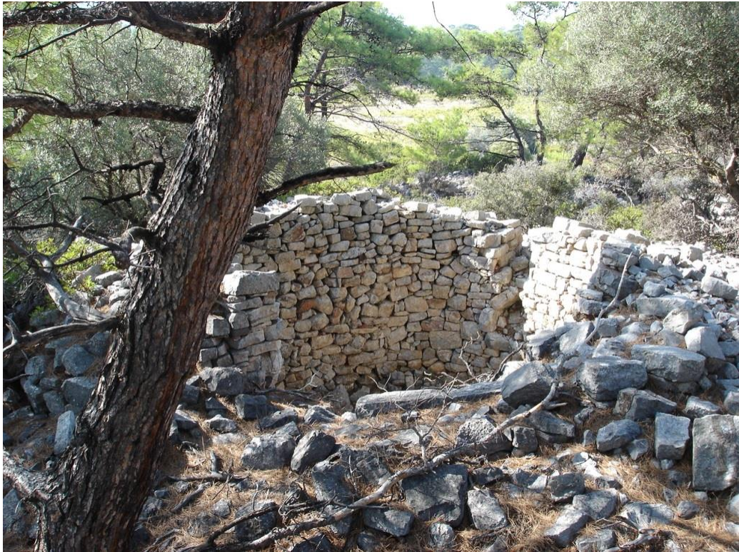
Fig. 21. Site Vassilika. Limekiln of the early 20th century.