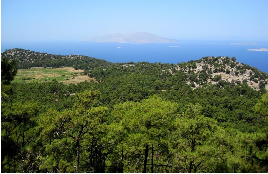
Figure 5. Kymissala. General view from the northeast today.