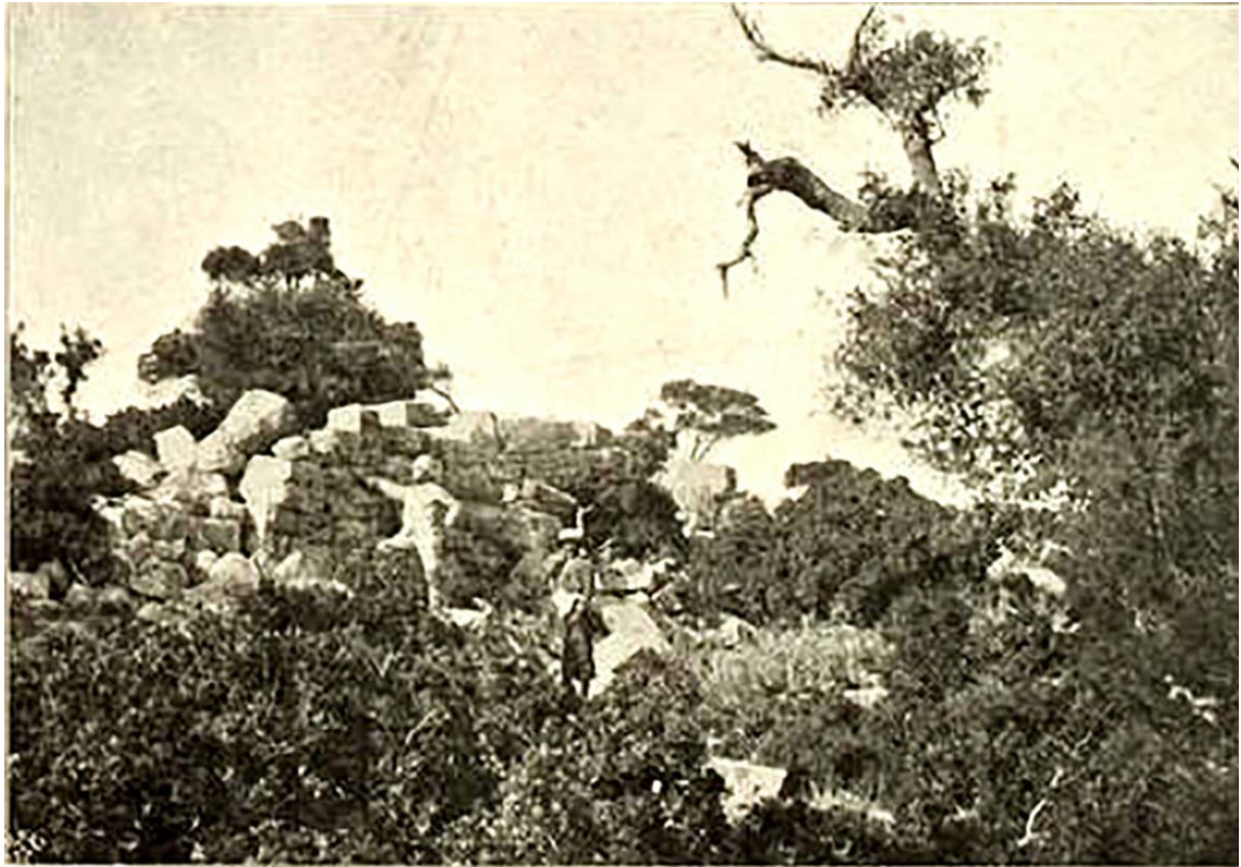
Figure 11. Site Vassilika. View of the settlement from the southeast in the early 1890s (Source: von Gaertringen 1899, 368, fig. 24).