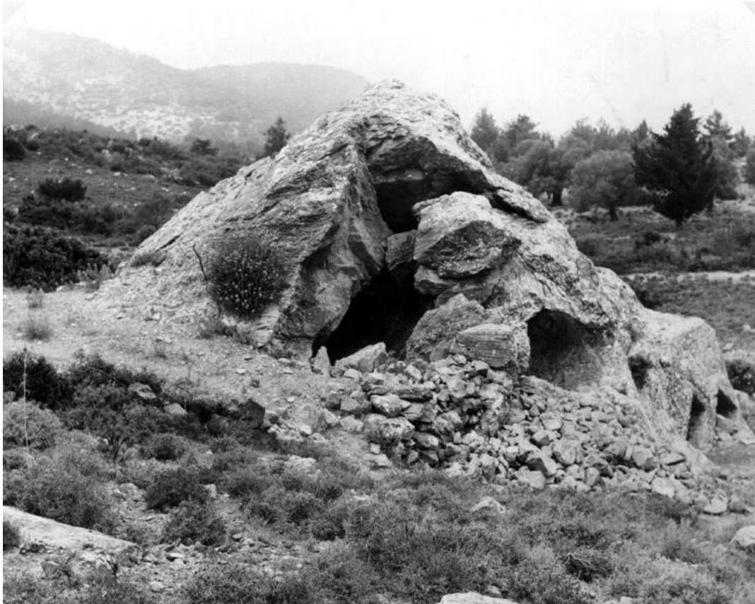
Figure 7. Site Alonia/Merouli or Koutsofti. View of the monumental tomb from the northeast in 1915 (Source: Maiuri 1916, 286, fig. 4).