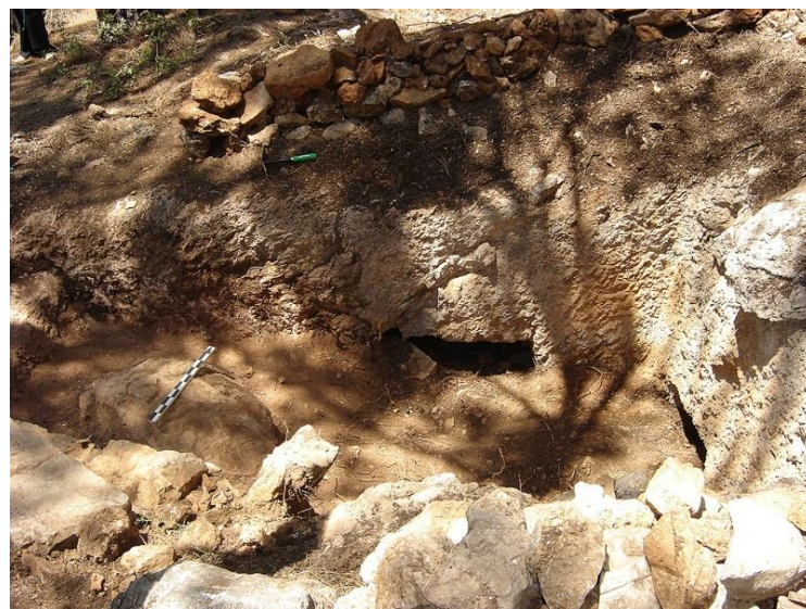
Figure 26. Site Kymissala Necropolis. Looted chamber tomb 3/2006 (Source: KARP).