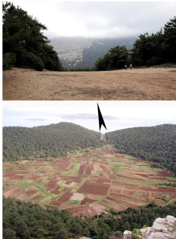
Figure 17. Kymissala. Views of the fire protection zone at the west end of the plain.