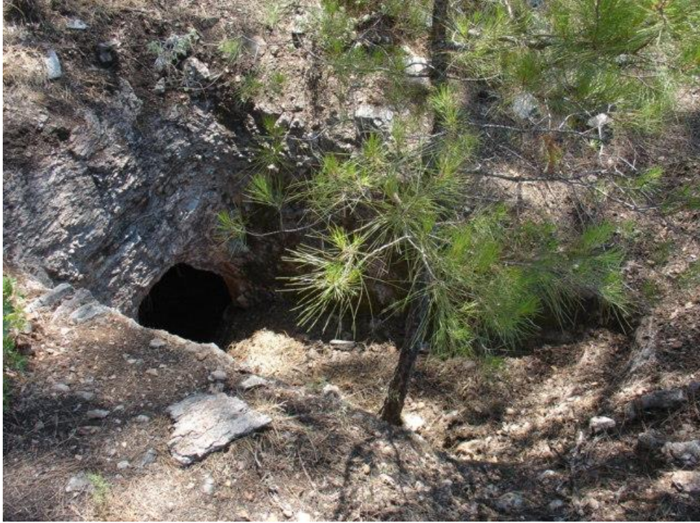
Figure 9. Site Kymissala, necropolis. Chamber tomb with a pine tree growing inside the antechamber.