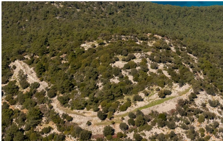
Figure 28. Aerial photo of the fortification walls of the acropolis at Hagios Phokas from the SW.