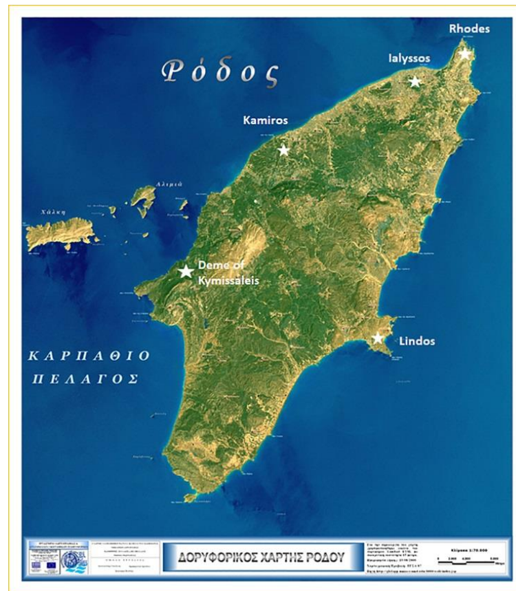
Figure 1. Rhodes Satellite Map, courtesy of Laboratory of Cartography and Geographic Information Systems, University of the Aegean, https://www.lib.aegean.gr/doryforikos-hartis-rodoy (last accessed 12-02-2024).