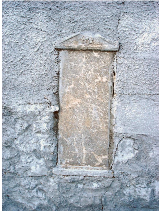
Figure 23. Monolithos village. Ancient Greek funerary stele decorating house wall.