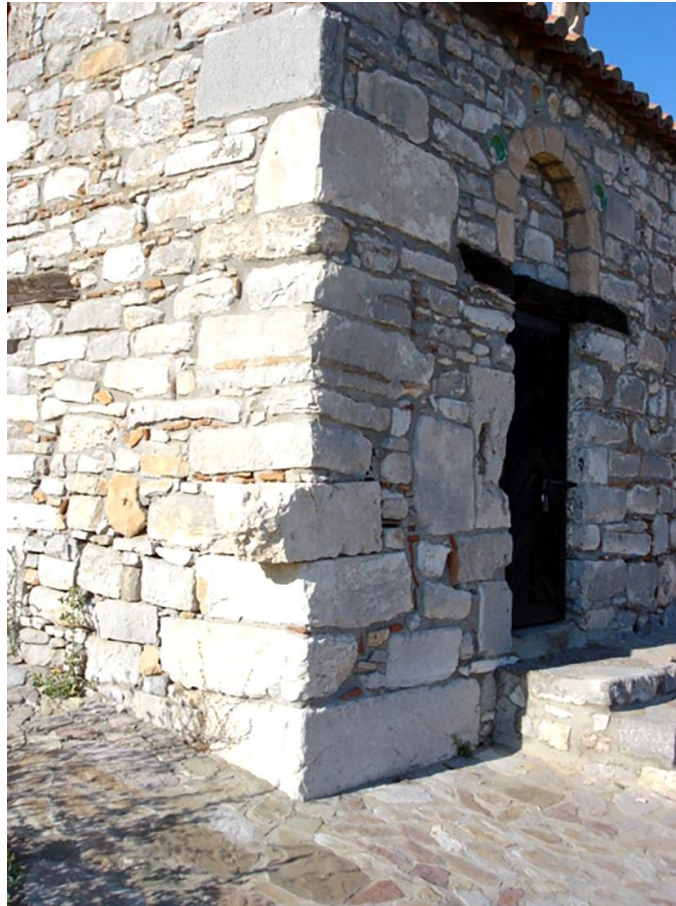
Figure 19. Monolithos village. St Thomas' church with reused ancient material.