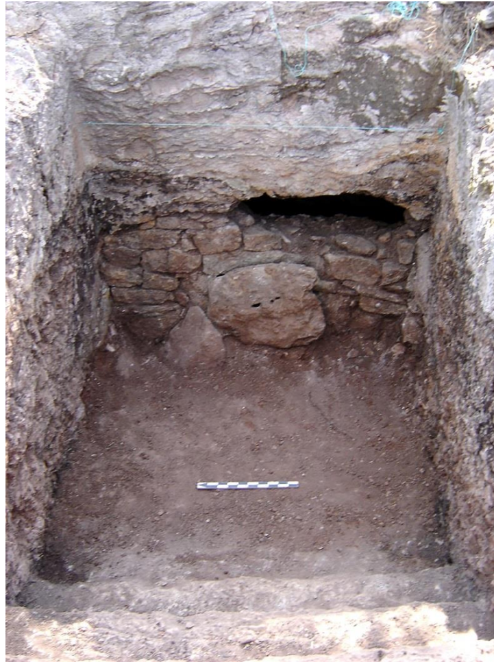
Figure 25. Site Kymissala Necropolis. Looted chamber tomb 4/2007.