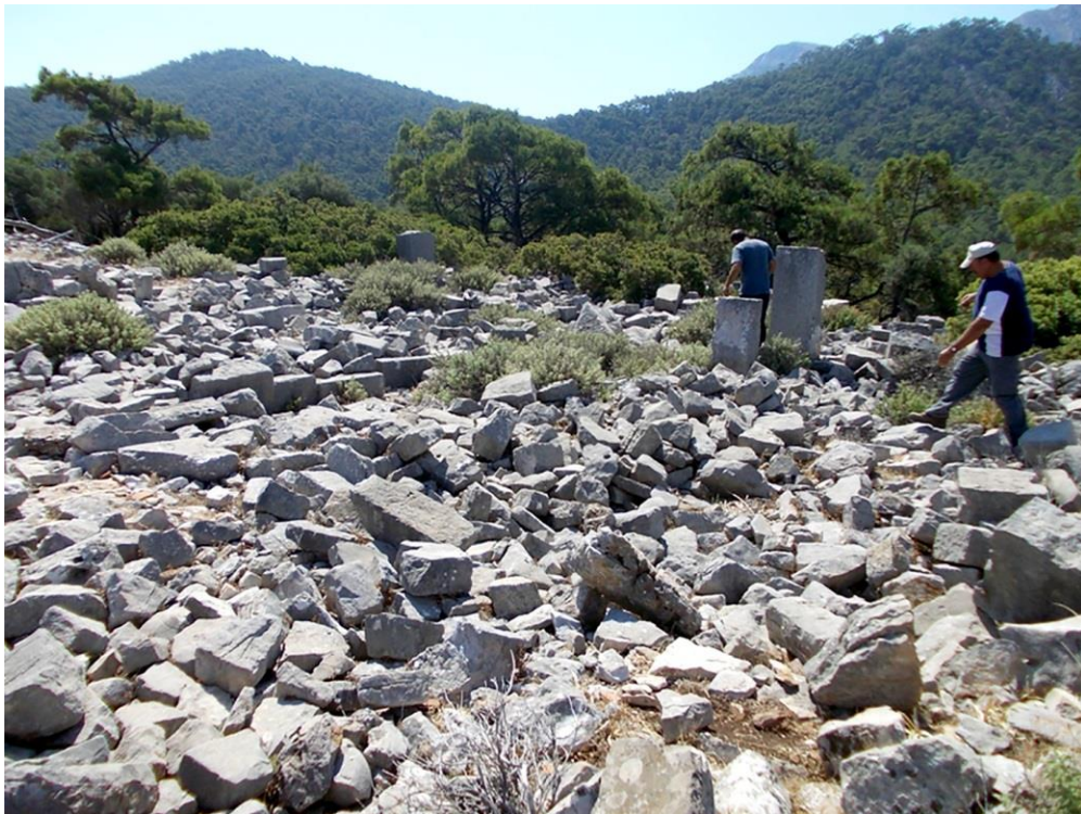
Figure 14. Site Vassilika. General view of the settlement (Source: KARP).