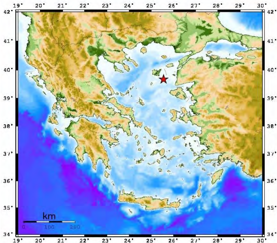
Figure 1- Epicentre map of the main shock of Lemnos 08/01/2013, 14:16 GMT, M=5.9.

As a case-study we selected the strong earthquake of magnitude M=5.9 which occurred in the sea-area SE of Lemnos island on the 8 th January 2013 (Figure 1) and its aftershock sequence.