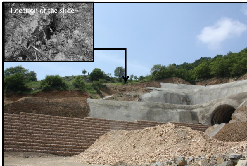
Figure 1 - View of the entrance portal of Nymfea tunnel. The gabion wall is used here for the stabilization of the whole slope. The slide occurred above the gabion wall.

The first case study discusses a slide that occurred close to the entrance portal of Nymfea tunnel (Figure 1). The rock mass in the area is comprised of gneissic schists in the surface and schistosed gneiss in depth. The rock mass is highly to completely weathered at the surface (type V and VII) and becomes moderately weathered (type III) in depth. Six boreholes with inclinometers and piezometers were drilled to investigate the slide. The identification of weak zones, the thickness of the weathered cover in the specific area and the evaluation of inclinometer and piezometer measurements were of primary importance. Taking into consideration the above parameters, it was evaluated that the slide was driven within the weathered zone, occurred after the excavations of the tunnel portal. It started several meters above the cut and ended in the second bench of the excavated cut, developing several cracks in the already applied shotcrete. The weathered zone, other geological features and the tensile cracks are highlighted in the Figure 2. It is highlighted here that sliding could have been also assisted by the weathered schistosity that is favourable dipping with 30° towards the slope.