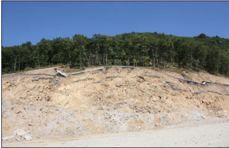
Figure 3 - The slide of the road cut O28. Drain trenches and benches have cracked.