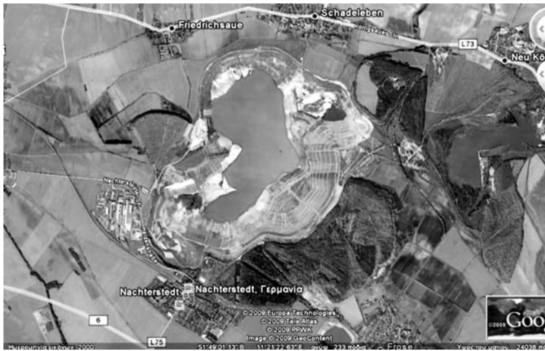
Fig. 2: Location of Nachterstedt City ( http://earth.google.com/download-earth.html/ ).

Nachterstedt is characterized by rhythmic and cyclic sedimentary sequences (Balaske, 1992, 1998). These cycles begin with sands, partly transgressive conglomerates, followed by silty sand and silt. The final members of such cycles form the coal seams. Reasons for the cyclic structure were interactions between global-eustatic and more local modifying factors (Salt tectonics halocinetic movements). In particular, during the middle Eocene in the descending part of the basin area of Nachterstedt three workable coal beds could develop. The age of these autochthonous coals, supported by tree stumps and root horizons, is clearly determined on the fossil content of the intermediate marine sediments and on pollen dating. By invasion of humic acids previously existing micro- and macro-fossils (foraminifera, bivalves and gastropods) had been dissolved. For stratigraphic classifications therefore mainly siliceous dinoflagellates have been used. These species characterise mainly a coastal habitat. Shallow marine sedimentary structures as well as local sand dunes in the profile series support such an interpretation (Woldstedt, 1926, Voigt, 1963, Ahrendt et al., 1995).