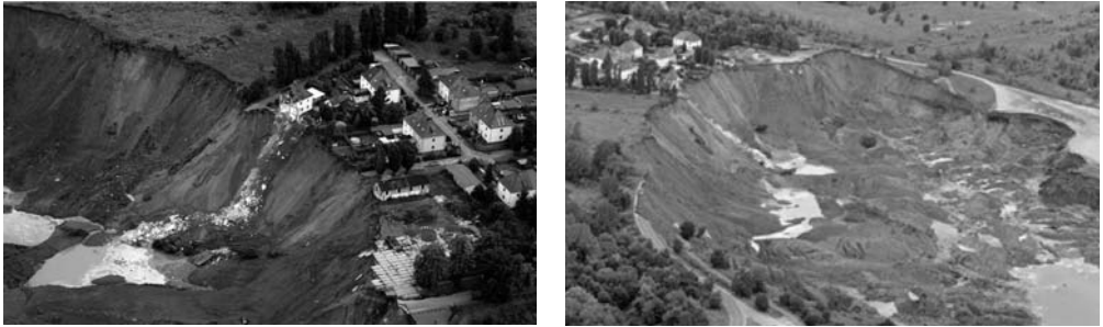
Fig. 1: The landslide of July 19, 2009, in Nachterstedt (Petley, 2009, http://daveslandslideblog.blogspot.com/ ).