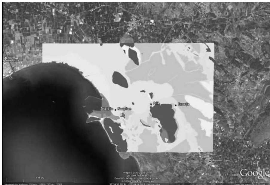
Fig. 5: Google Earth representation of geological formations from the broader area of Nafplio (Pothiades, 2008).