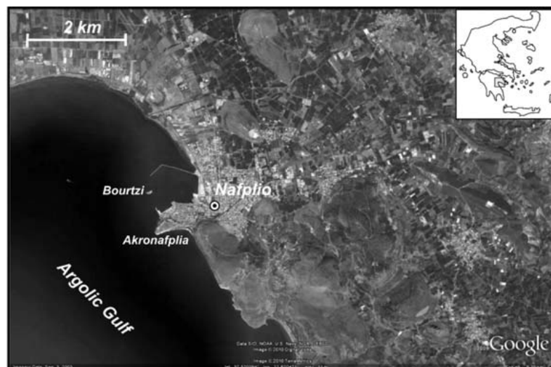
Fig. 1: Satellite image from Google Earth showing the location of the city of Nafplio and main topographic features of the broader area.

of studies, as well as reference point for possible future changes, ensuring the spatial and geological coherency of the entire data set (maps, borehole logs, geophysical measurements, etc). Furthermore, the interoperability of data banks at urban and national levels is a stake of prime importance for all providers of referenced geological data.