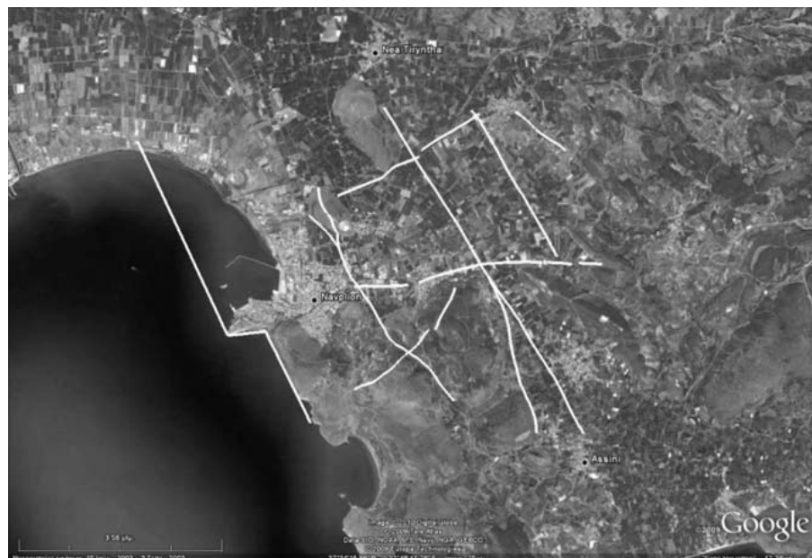
Fig. 6: Google Earth representation of neotectonic linear features from the broader area of Nafplio (Galanakis and Georgiou, 2008).

broader area of Nafplio is characterized by the existence of active and potentially active faults mainly found in the boundaries of basins (Fig. 6).