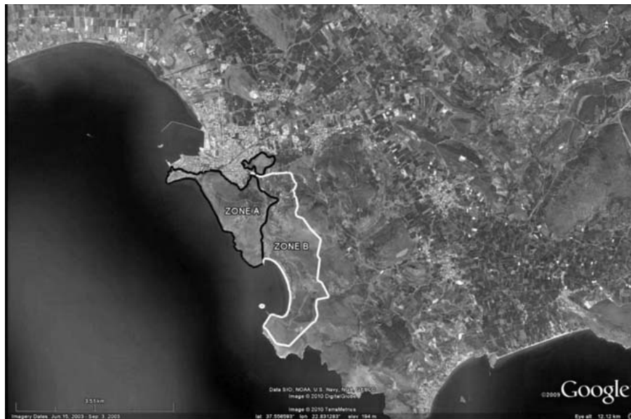
Fig. 8: Google earth representation of archaeological protection zones for the Nafplio area. Zone A corresponds to totally protected areas where no construction is allowed; Zone B encloses partially protected areas where conditional construction is allowed.

Through the Google Earth platform the derivative maps (geological, geotechnical, geochemical, geophysical etc.) and other digital data such as sampling points, elevation models, 2D – 3D digital surfaces are available and accessible to all, public or private sector or even general public, managing issues concerning the protection and enhancement of the urban and suburban environment.