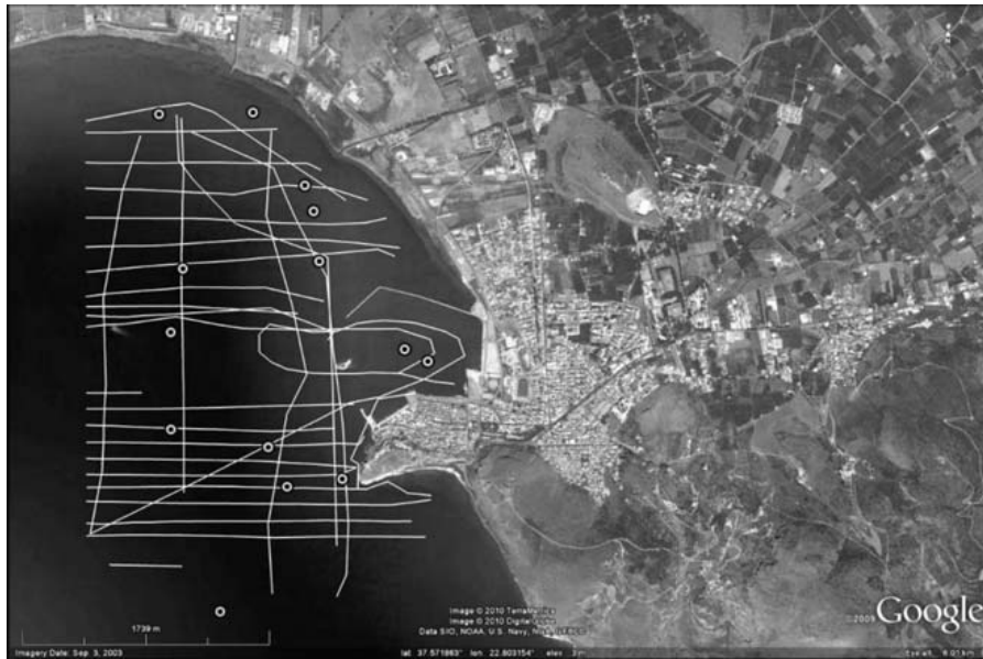
Fig. 7: Google Earth representation showing the location of seismic-reflection profiles and surface samples collected from the Argolic Gulf (Andrinopoulos et al., 2008).