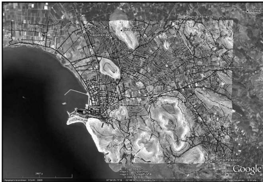
Fig. 4: Google Earth representation of topographic linear spatial features (contours, hydrological network, transportation network) from the broader area of Nafplio.

spatial measurements, and “tilting” of landscapes for enhanced 3D views. These tools are often sufficient to allow the non-GIS user to obtain specific information of interest from the data.