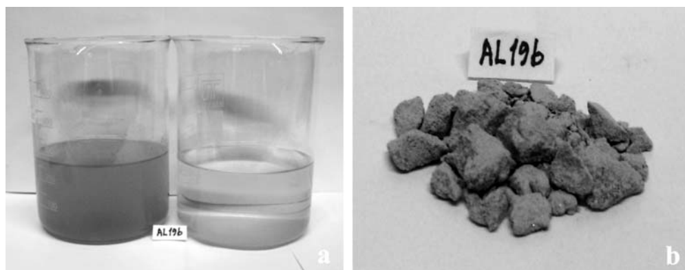
Fig. 3: a) Left: Starting urban wastewater (SUW), Right: Overflowed clear water (CW) after the HENAZE treatment. b) Odorless and cohesive zeo-sewage sludge, dried overnight at RT.