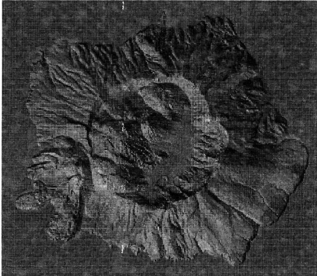
Fig. 3 Differential Interferometric image for the period 4-9-95/20-8-96

The results clearly show the necessity for DiNSAR technique to be included systematically as an important component in a EWS although actually it is not possible to apply the technique in "real time".