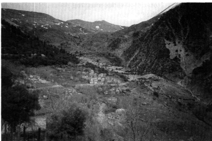
Figure 1 - A panoramic view of the Petroxori village

In general, Pindos zone formations are characterized by an extremely complicated structure. They appear highly folded in a series of anticlines and synclines, interrupted and displaced by fracturing and faulting. Particularly, at the center of the village, the flysch formation occupies the core of a syncline structure with an axis of N.NW-S.SE direction and a plunge towards N.NW. Both, the eastern and western limbs of this syncline are occupied by the transition to the flysch