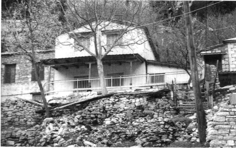
Figure 5 - A typical example of slope that failed during a year with prolonged high precipitation because of the increased loading of its crest. The landslide caused extended damages to the house