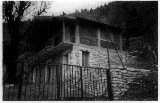
Figure 3 – Reconstruction and extension of an old house

According to the same reporting method (WP/WLI 1994), the triggering causal factors of those landslides are, regarding the physical processes, the prolonged high precipitation and, regarding the man made processes, the loading of slopes or their crests and the uncontrolled flow of the surface water through the village (natural irrigation and water leakage from services). The loading of the slope was succeeded by the construction and lately the reconstruction and the extension of buildings (Fig. 3) and the uncontrolled flow of the surface water through the village (Fig. 4) was caused by lack of drainage network.