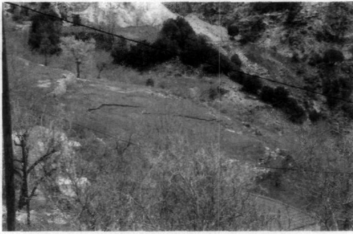
Figure 2 - Rotational slides affecting the terraces