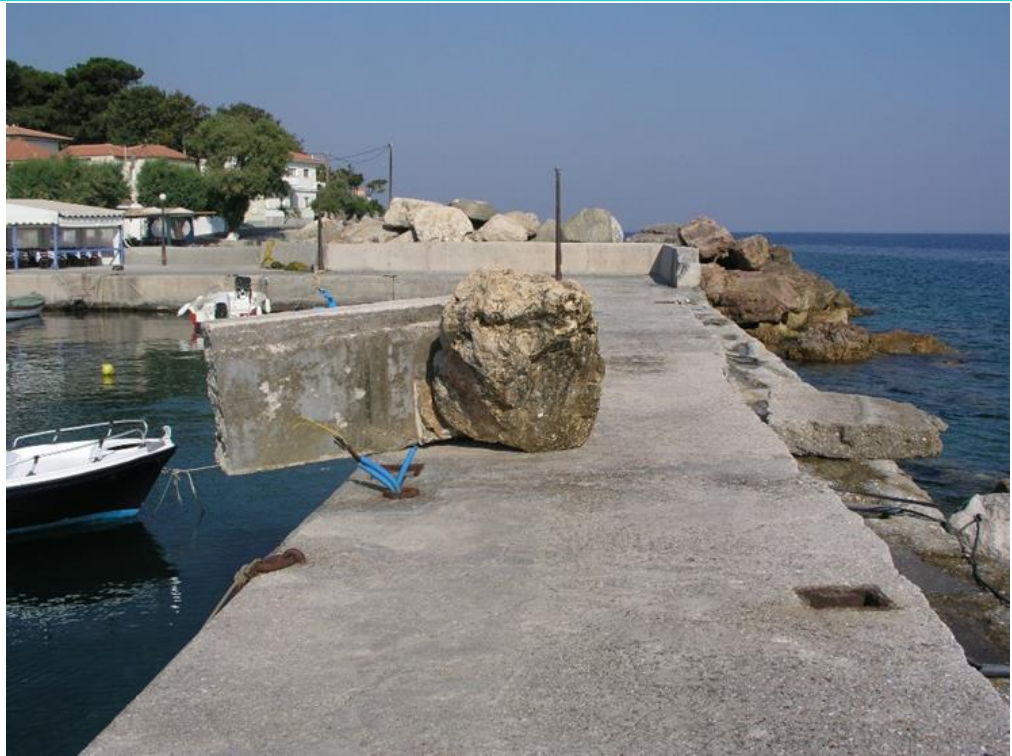
Fig. 2: The Agios Konstantinos (Samos) harbour mole, striking nearly E-W, after the 2004 cyclone, view from the east. Damage caused is clearly visible. After the storm (cyclone) a part of the concrete wall protecting the mole from northern winds was found displaced, along with a boulder protecting the mole to the north. Missing parts of the concrete wall and other boulders from the seaside part of the mole were catapulted to the harbour basin.