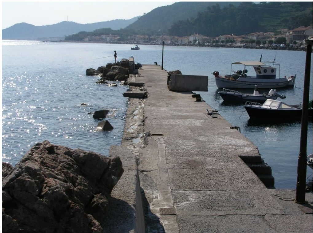
Fig. 3. The harbour mole of Agios Konstantinos (Samos) view from the west. Damage in the protective wall and missing boulders from the seaside part of the mole can be