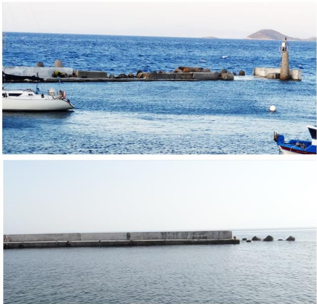
Fig. 4. Some of the damage to the harbour mole of Kokkari (top) and of Agios Konstantinos (bottom) because of the 2020 earthquake (view to the north). The east part of the Kokkari mole was seriously damaged, while most boulders protecting the east edge of the Agios Konstantinos mole were thrown into the water.

Fourth , should the two marine invasion events in Samos, the 2004 meteorological tsunami and the 2020 earthquake-generated tsunami had occurred earlier, in a period not covered by detailed observations, a mixture of two, nearly co-eval events would have been observed. The only possibility to study them would have been through geomorphological observations and sedimentological and radiocarbon analyses. From such a study, it is likely that the mixture of the two distinct nearly co-eval events (earthquake and storm) would appear as a single, larger scale event, a tsunami, or an even more extreme storm. This implies that in various other cases, a combination of different events should be examined as a possibility for mobilization of coastal boulders.