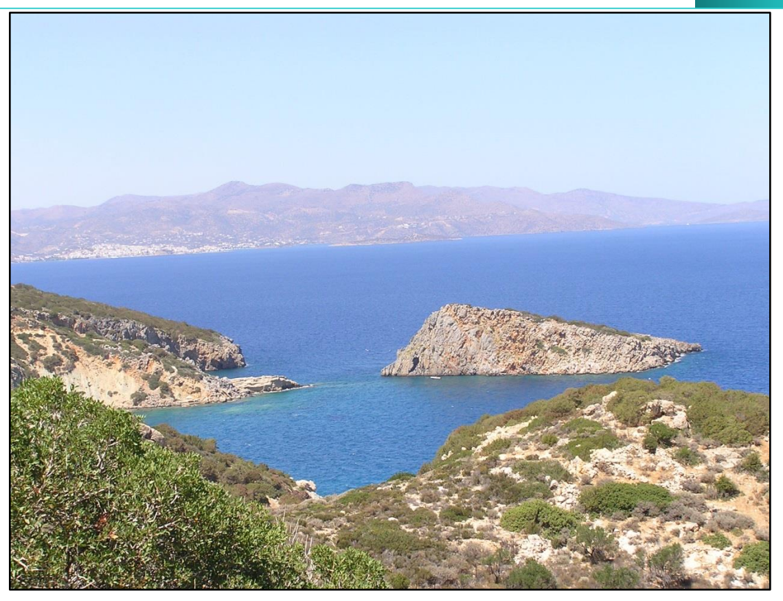
Fig. 8: Istron area, the islet of Vryonēsi or Prassonēsi (Gulf of Merambello, Crete). View from the SE.

Analogous graffiti have been observed in coastal quarries, such as in the marble quarries of Alykē on Thasos Island; they are attributed to mariners who were employed in the transportation of the marble blocks (IG XII, 8, 581-586. Chapouthier, 1935, 378). Another example comes from the foot of the Akrokerauneia Mountains in Epirus; in the cove named \epsilon i \zeta \tau \alpha \Gamma \rho \alpha \mu \mu \alpha \tau \alpha (= at the Letters) numerous graffiti of sailors /mariners have covered slopes that have been quarried (Heuzey & Daumet, 1876, 406-408; Chapouthier, 1935, 378, n.4). The securing of a safe anchorage in the islet of Prasonēsi implies the inability of the ships to securely approach the coast of Istron. This suspicion is further strengthened by the submarine geological research by Mourtzas (Mourtzas, 1990, 297, Fig. 83 c); the fluctuations observed not only in the form but also in the depth of the shorelines at Istron are considered to be a result of the strong waves to which the coast is exposed ("of course micro tectonic movements are not excluded"). The strong north winds prevailing in the Merambello Gulf are also pointed out by Captain T.A. B. Spratt who sailed around Crete in 1865 (Spratt I, 1865, 214). The depth of the ancient quarry