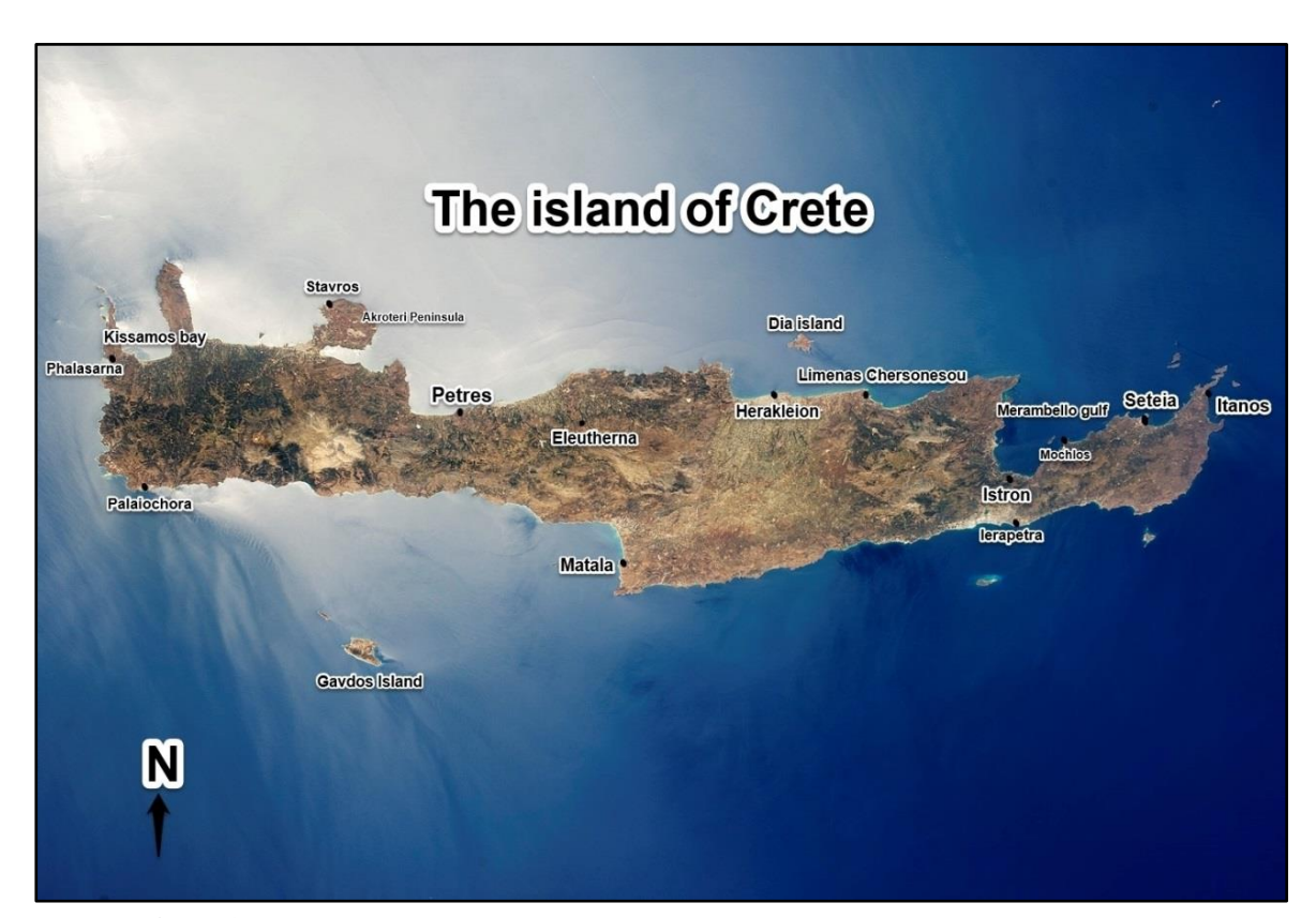
Fig. 1: Satellite image of the Island of Crete.

The ancient coastal quarries of Crete (Fig. 1) are of special interest due to the idiomorphic coasts, today either sunken or raised (Spratt I, 1865, 141; Stiros, 2010). In some cases, the ancient quarries at the western part of the island are raised and quarries at the eastern part are partly sunken below modern sea level. It is a general trend, as in Kissamos Bay, that some ancient quarries are uplifted, whereas some Venetian ones are sunk, indicating a continuous tectonic instability of that area.