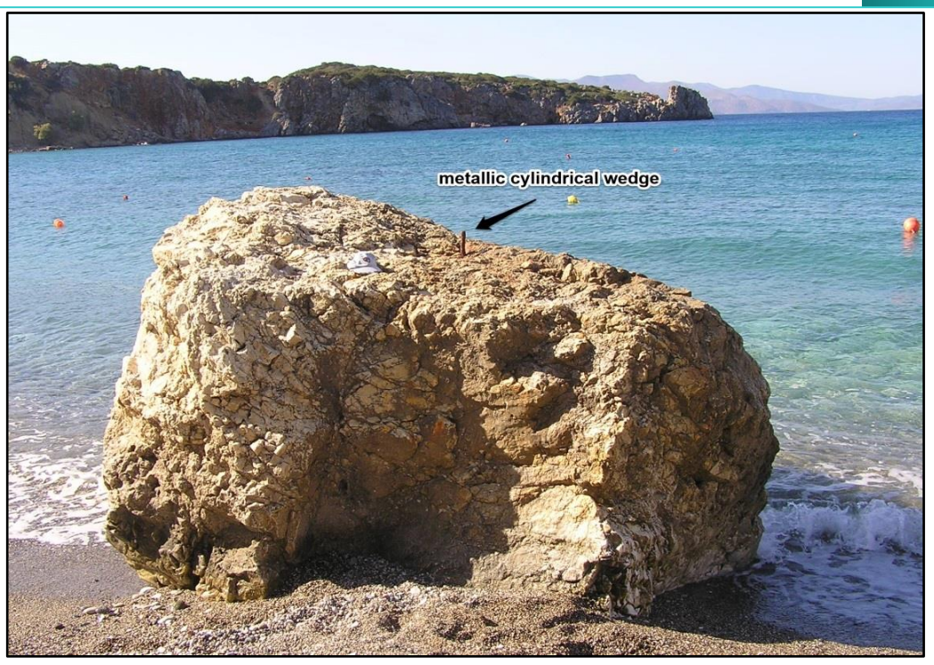
Fig. 9: Istron, western bay (Merambello Gulf, Crete). Cube of white marble, almost 2 m in visible height, with a metallic cylindrical wedge in situ , at the beach.