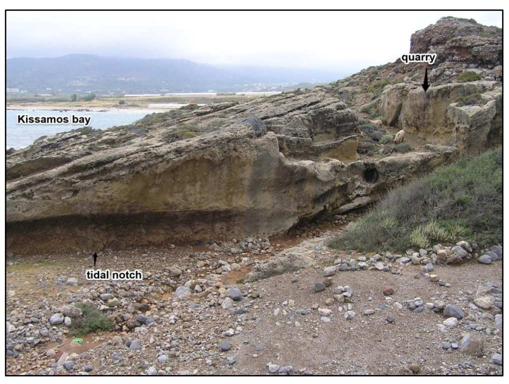
Fig. 3: Kalyvianē, Kissamos bay (western Crete). Upraised coastal sandstone quarry.