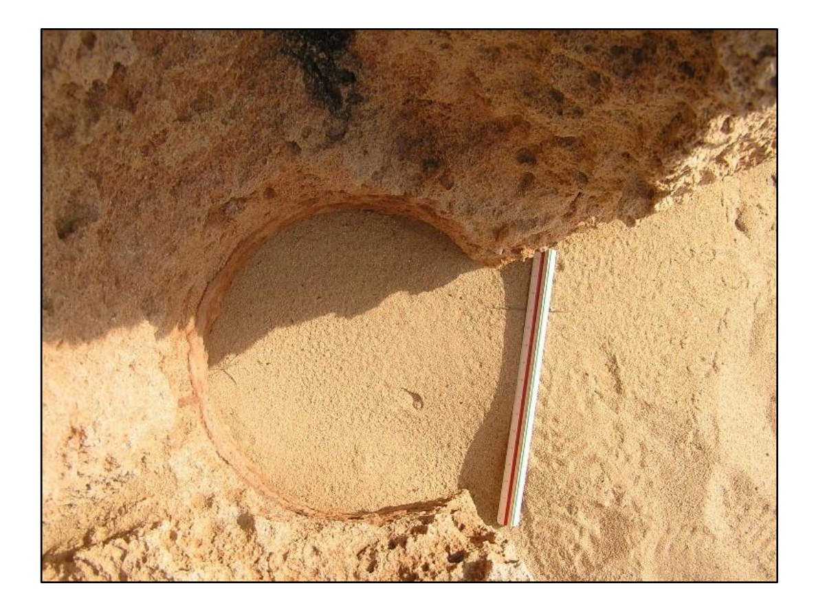
Fig. 5: Stavros, Akrotēri Peninsula (western Crete). Circular holes in the area of the coastal sandstone quarry. Scale of 0,32 m.

section; their diameter reaches almost 0,10 m - 0,15 m and their depth 0,20 m. Their inner surface is smooth, yellow and harder than the surrounding rock (Guest-Papamanoli, 1989, 115, 117 Fig.4). According to Guest-Papamanoli (1989, 115,122) some of these holes could have been opened by the quarrymen, in particular by the Minoans for the insertion of poles and wooden beams. It is even reported that some with an ovoid section were finished, in order to become square (Guest-Papamanoli 1989, 122). An exception to these relatively small-sized tubular holes is a very large cylindrical one whose diameter measures 1,35 m and its depth 0,50 m - 0,60 m. Nowadays it is full of sand (Fig. 6. Usually, the cylindrical holes of 0,18 m - 0,23 m, reach 1,00 m in depth, a characteristic that was noticed in a similar case at Potamos beach, Malia).