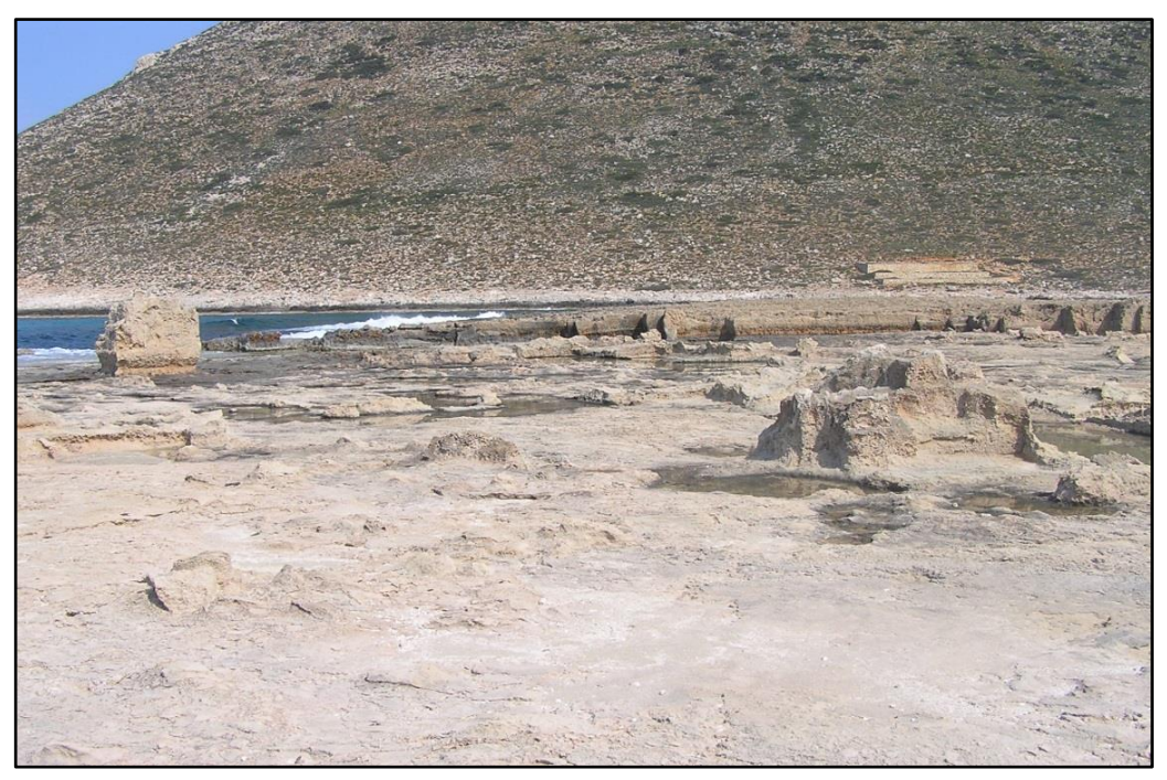
Fig. 10: Stavros, Akrotēri Peninsula (western Crete). Cube of sandstone, left intact at the quarries, perhaps a sort of indicator for the amount of cubic metres extracted from the site. Notice the tidal notch in its base, an indication of past flooding (Kelletat, 1979).