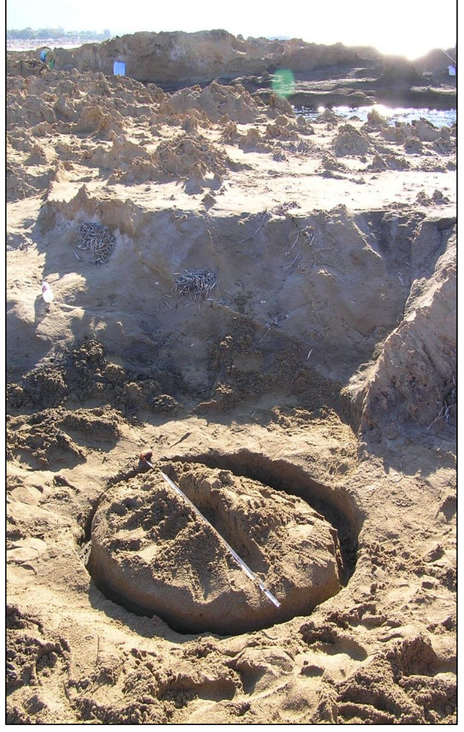
Fig. 6: Malia, Potamos beach. Cylindrical hole (1,35 m in diameter), now full of sand, in the area of the sandstone quarries.

On the contrary, certain circular holes of 0,04 m in diameter reported from coastal and inland quarries are indeed traces of quarrying activity (Tziligkaki, 2014, 504-506 with reference to Cretan sites). The one found in the coastal limestone quarry of Petres (Fig. 7) is very similar to the one found in the limestone quarry of Vrysidia at Eleutherna, at an altitude of 345 m in central