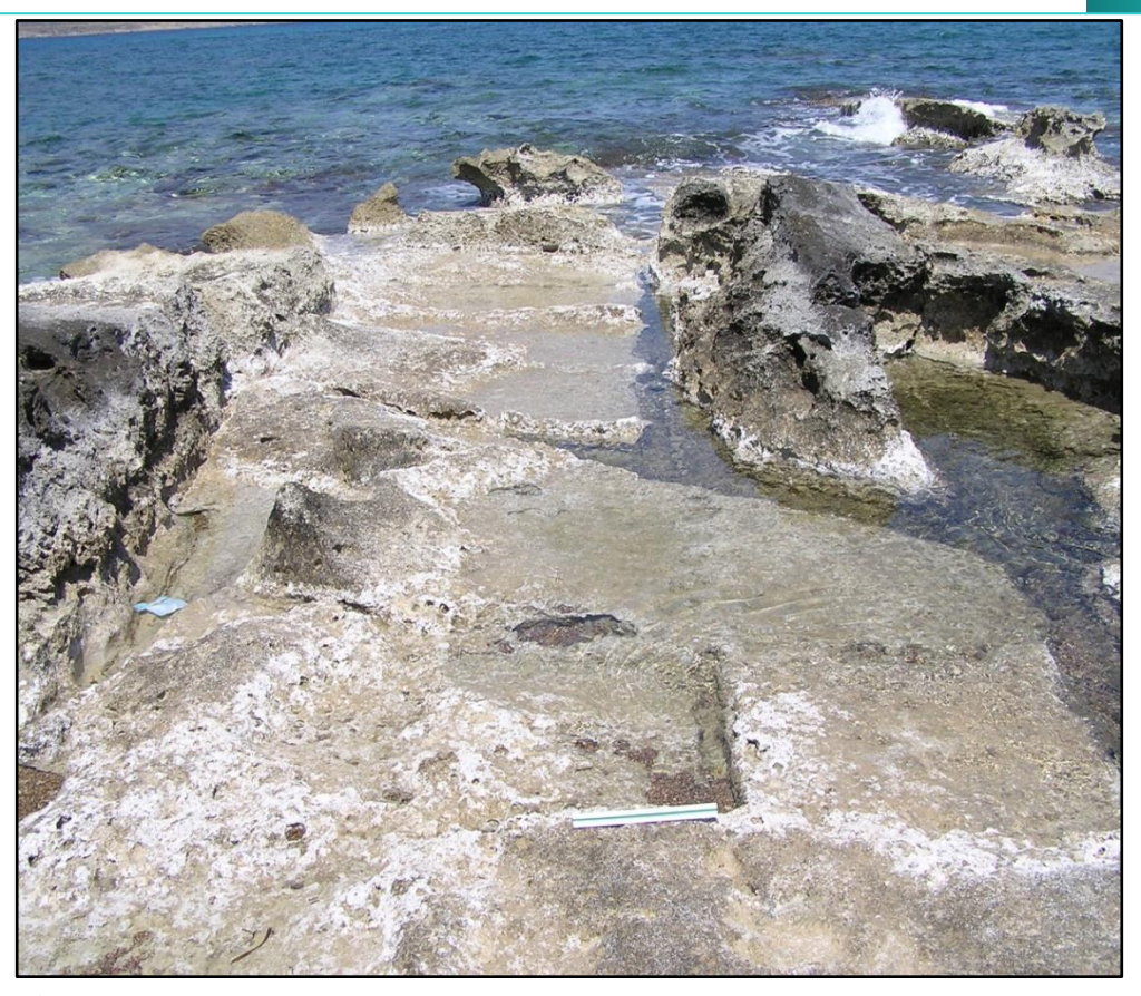
Fig. 2: Viglia, Kissamos bay (western Crete). Partly submerged limestone quarry. Scale of 0,32 m.