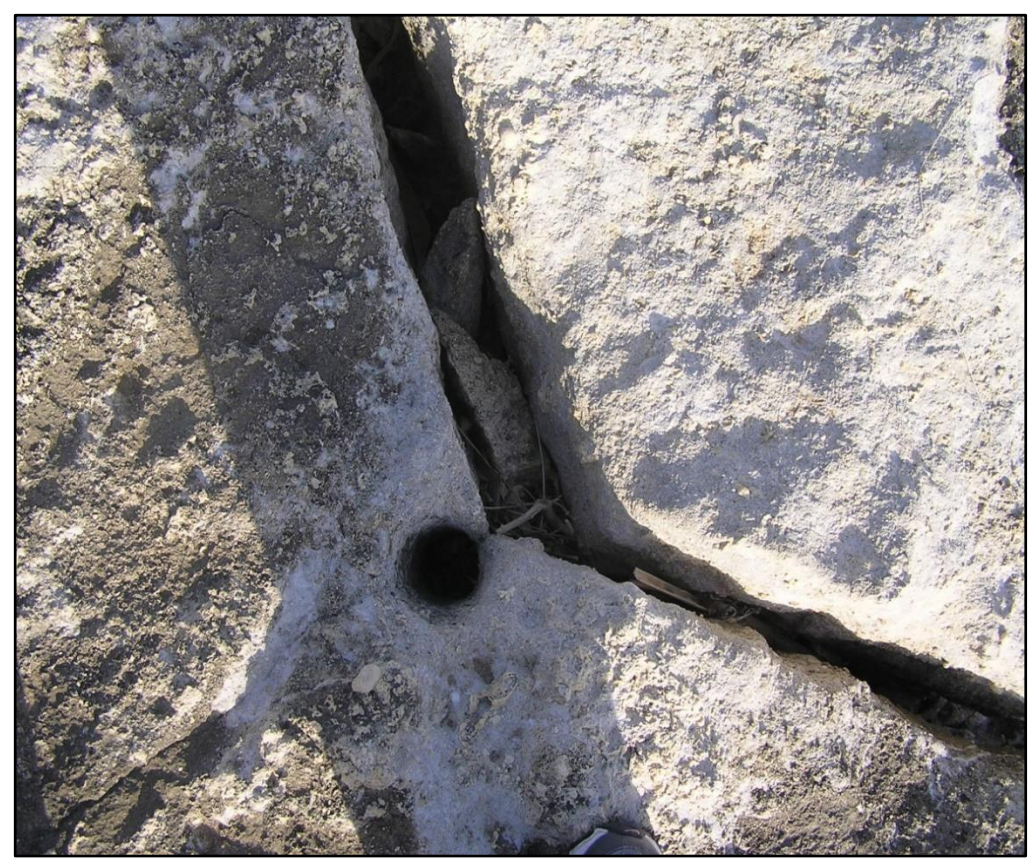
Fig. 7: Petres (north Crete, Rhethymnon Prefecture). Circular hole (0,04 m in diameter) in the coastal limestone quarry. Scale 1:2.

Crete (Tziligkaki, 2014, site P1 for Petres, and site P24 for Vrysidia). The usual practice was to insert wooden cylindrical wedges that would help the rock to fracture; a practice used in Poland and medieval whetstone quarries at Crete (see Dworakowska, 1987, 28; Mamakis, 2004, 113, 116). In the Northeastern islands of Greece, Lēmnos, Lesvos and Chios, the medieval tool used for the opening of holes is called tsokos (a tool with two points) or velones (see Digital Charter).