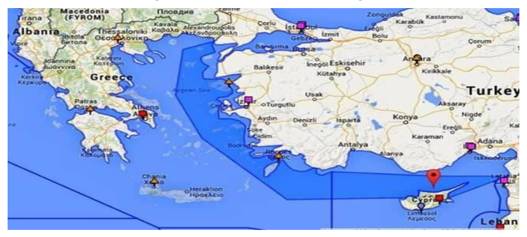
Figure 1: Turkish Claim in the Aegean

The main reason that Turkey promotes the illegal Immigration towards Greece is because of the long going Aegean Dispute between the two countries. The Turkish Coast Guard (TCG) published, alleged official maps and documents claiming that half of the Aegean Sea belong to Turkey. In this sense, Ankara claims to won dozens of Greek islands, the entire eastern Aegean from the island of Samothraki in the North to Kastellorizo island in the South. The maps and claims have been uploaded on the website of the Turkish Coast Guard Sahil Güvenlik Komutanlığı in the context of a 60-page report about the activities of the TCG in 2016. On page 7 and 13 of the report, the maps allegedly show Turkey's Search And Rescue responsibility area. The maps show half of the Aegean Sea and also a very big part of the Black Sea, where Turkey's SAR area coincides with the Turkish Exclusive Economic Zone (EEZ). It should be noted that Turkey has not signed the International Convention for the Law of the Sea of 1982, which delimits the boundaries of the EEZs. However, Turkey claims an EEZ of more than 200 nautical miles.<sup>7</sup>