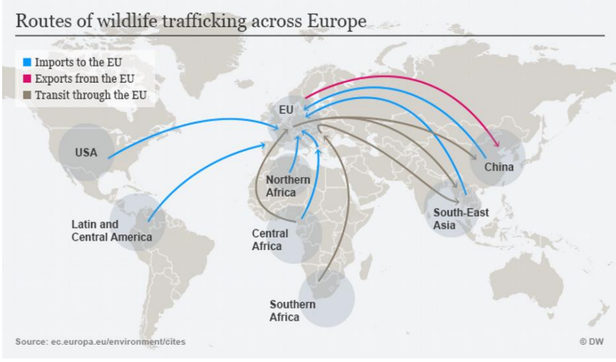
Figure 1: Routes of wildlife trafficking across Europe

Given the fact that illegal trade is a hidden activity, the access to reliable data about the scale and the total value of the market is a difficult procedure. Nonetheless, according to a recent report of the European Commission (2016) approximately 2000 live reptiles, corals and ivory quantities were seized in EU borders within a period of only a year. In addition, the known proportion of the exchanged fauna and flora represents around 10% to 15% of the total wildlife products in illicit trade (Banos-Ruis, 2017), meaning that the unknown dimensions of the problem are even greater with their repercussions being unpredictable. In order to have a spherical view of the EU's wildlife trafficking, the following graph presents the main trade routes and partners of the Union.