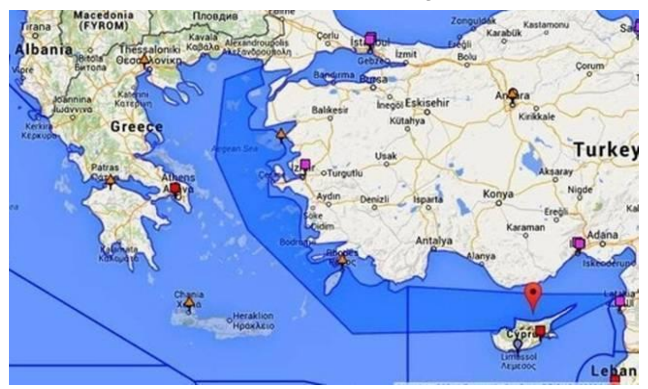
Chart 1: Turkish Claim in the Aegean