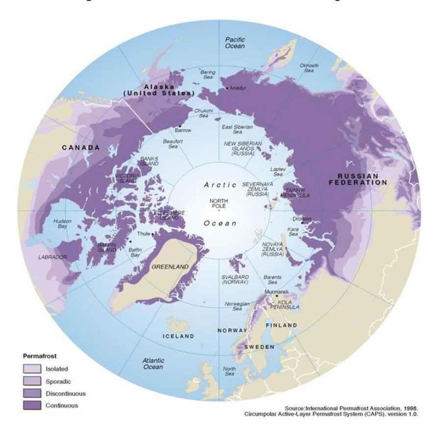
Map: Permafrost in the Northern Hemisphere

As it can be perceived, permafrost mainly occurs in colder regions in the north and south, or even at high altitudes, such as the Alps (Huissteden, 2020). Permafrost can also be detected at the bottom of the Arctic Ocean. At the soil surface of permafrost soils, the top layer, which is mainly referred as the "active layer", thaws in summer and refreezes in winter every year. The base of the active layer is called "permafrost table". The active layer is thinner in colder regions and thicker in the warmer climates of its zone.