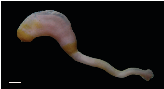
Fig. 1: Specimen of Phascolion caupo from San Pedro del Pinatar (Western Mediterranean). Scale bar = 1 mm.

face area of 0.04 m 2 . To separate the macrofauna from sediment, the samples were sieved through a 0.5 mm mesh screen. Afterwards, the macrofauna was fixed in 10% buffered formalin and preserved in 70% ethanol. Depth and sediment type were recorded at each station (Buchanan, 1984). Sipunculans were dissected to study their internal anatomy using a binocular microscope and fine scissors with a 3 mm blade (Moria MC19). Small structures with high taxonomic value, such as papillae and hooks, were observed under the microscope. To identify the species, we examined the introvert hooks, a distinctive characteristic between P. caupo and P. strombus (Cutler, 1994). Phascolion strombus presented claw-like hooks (type I hooks) (Fig. 3A), while P. caupo presented scattered broad-based hooks, with the tip rounded (type III hooks) (Fig. 3B).