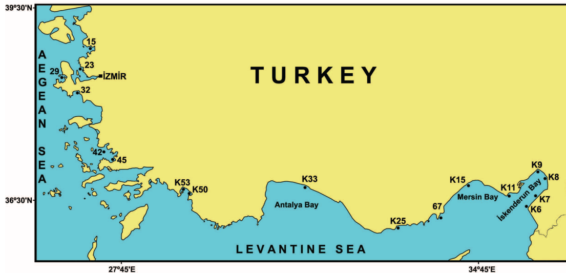
Fig. 1: Map of the investigated area with the location of sampling sites.

ricana ) are new for the Turkish fauna and two species ( Ceratonereis mirabilis and Onuphis eremita oculata ) are new for the entire Aegean Sea.