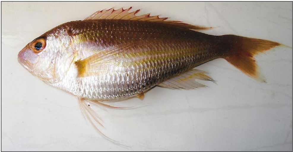
Fig. 3: Nemipterus randalli .

Specimens of this species were first caught off Alexandria at a depth of about 80m in 2008. Additional specimens were later caught