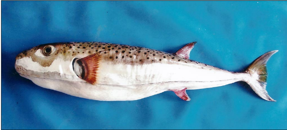
Fig. 5: Lagocephalus sceleratus .