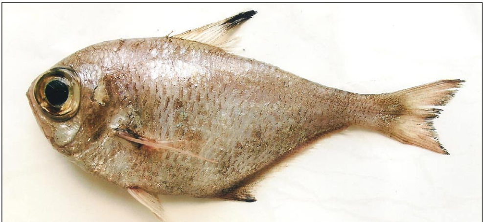
Fig. 4: Pempheris vanicolensis .