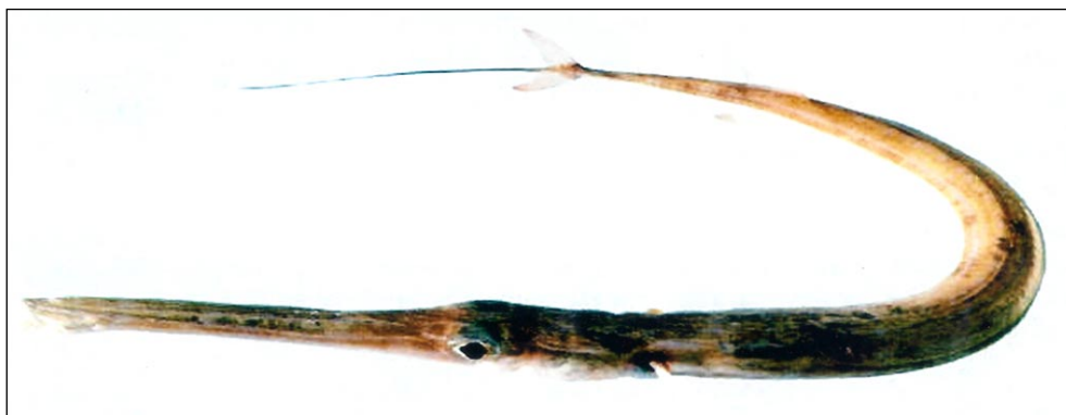
Fig. 2: Fistularia commersonii .