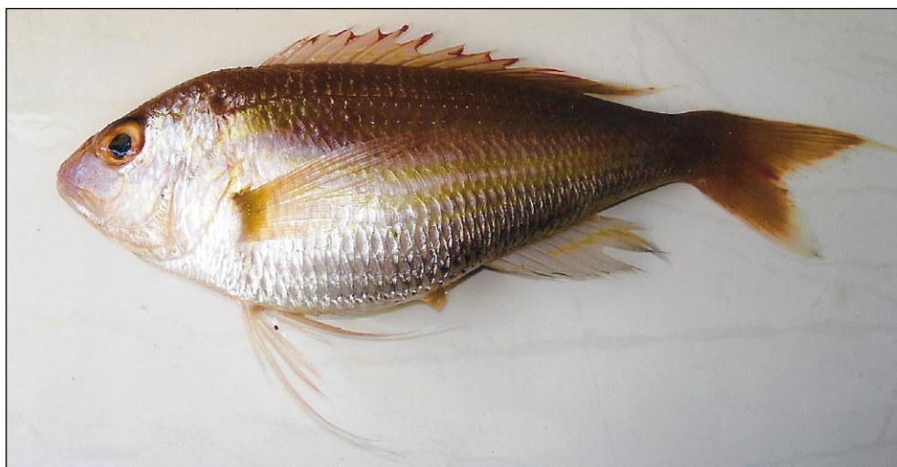
Fig. 3: Nemipterus randalli .

Specimens of this species were first caught off Alexandria at a depth of about 80m in 2008. Additional specimens were later caught