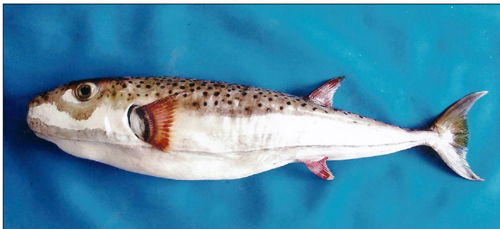
Fig. 5: Lagocephalus sceleratus .