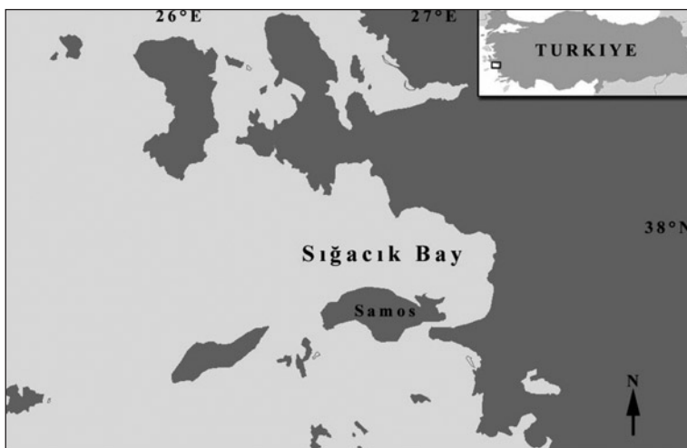
Fig. 1: Map of sampling area.

All sampled individuals were sorted according to sex by checking the external genital organs. To determine the relationships between the various length measurements, as well as the length-weight relationship, a total of 659 specimens were captured and put in jars containing a 10% seawater-formalin solution. Carapace length, CL, was measured as the distance from the postorbital margin to the mid-dorsal posterior edge of the carapace, to the nearest 0.1 mm using digital callipers; total length, TL, was measured as the distance from the tip of the rostrum to the end of the telson to the nearest 0.1 cm using a 30-cm ruler; body width, BW, was measured as the maximum width of the carapace to the nearest 0.1 mm with digital callipers; and the wet weight, W, was taken using a digital balance with a precision of 0.01 g. Kolmogorov-Smirnov (K-S) tests were used to compare the differences between length distribu-