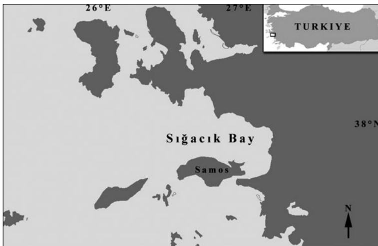
Fig. 1: Map of sampling area.

All sampled individuals were sorted according to sex by checking the external genital organs. To determine the relationships between the various length measurements, as well as the length-weight relationship, a total of 659 specimens were captured and put in jars containing a 10% seawater-formalin solution. Carapace length, CL, was measured as the distance from the postorbital margin to the mid-dorsal posterior edge of the carapace, to the nearest 0.1 mm using digital callipers; total length, TL, was measured as the distance from the tip of the rostrum to the end of the telson to the nearest 0.1 cm using a 30-cm ruler; body width, BW, was measured as the maximum width of the carapace to the nearest 0.1 mm with digital callipers; and the wet weight, W, was taken using a digital balance with a precision of 0.01 g. Kolmogorov-Smirnov (K-S) tests were used to compare the differences between length distribu-