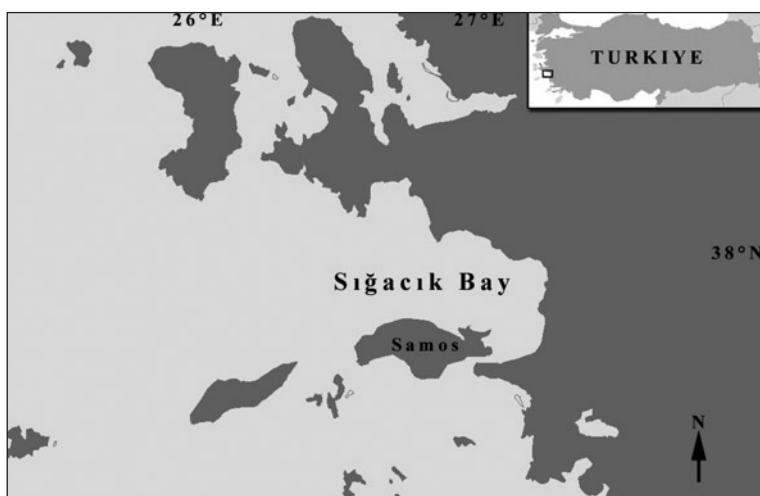
Fig. 1: Map of sampling area.

All sampled individuals were sorted according to sex by checking the external genital organs. To determine the relationships between the various length measurements, as well as the length-weight relationship, a total of 659 specimens were captured and put in jars containing a 10% seawater-formalin solution. Carapace length, CL, was measured as the distance from the postorbital margin to the mid-dorsal posterior edge of the carapace, to the nearest 0.1 mm using digital callipers; total length, TL, was measured as the distance from the tip of the rostrum to the end of the telson to the nearest 0.1 cm using a 30-cm ruler; body width, BW, was measured as the maximum width of the carapace to the nearest 0.1 mm with digital callipers; and the wet weight, W, was taken using a digital balance with a precision of 0.01 g. Kolmogorov-Smirnov (K-S) tests were used to compare the differences between length distribu-