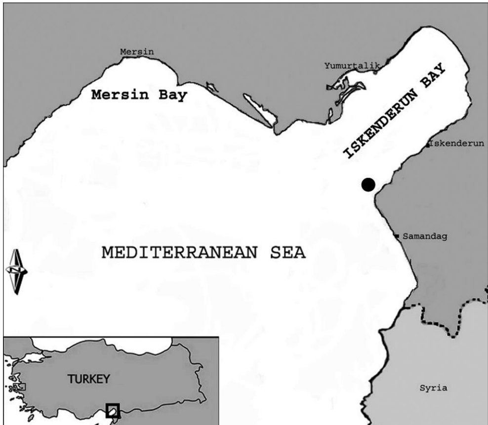
Fig. 1: Sampling location (●) of Tylerius spinosissimus .

um of the Faculty of Fisheries, Mustafa Kemal University, Iskenderun-Hatay (collection number: MSM-PIS/2010-9).