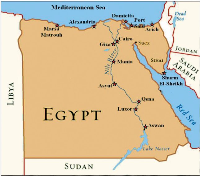
Fig. 1: Rain water sampling locations along Egypt.

as a distribution pattern (mm/yr). This figure indicates that only the northern part, including Sinai, have a moderate available rain amount within which rain harvesting can be implemented. The rest of the country is very poor in rainwater. Table 5 reports