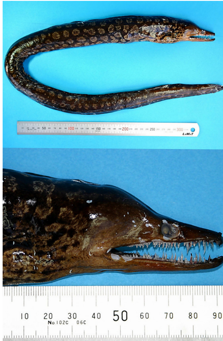
Fig. 2: The fangtooth moray Enchelycore anatina captured at Kolimbia bay, Rhodes Island on the 13th of April 2010.

the Nile River inhibiting the westerly expansion of species (RILOV & GALIL, 2009). The rate of introductions into the Mediterranean has increased over the last decade and it is estimated that there is one new introduction every 9 days (ZENETOS et al. , 2008; ZENETOS, 2010). Continuous mon-