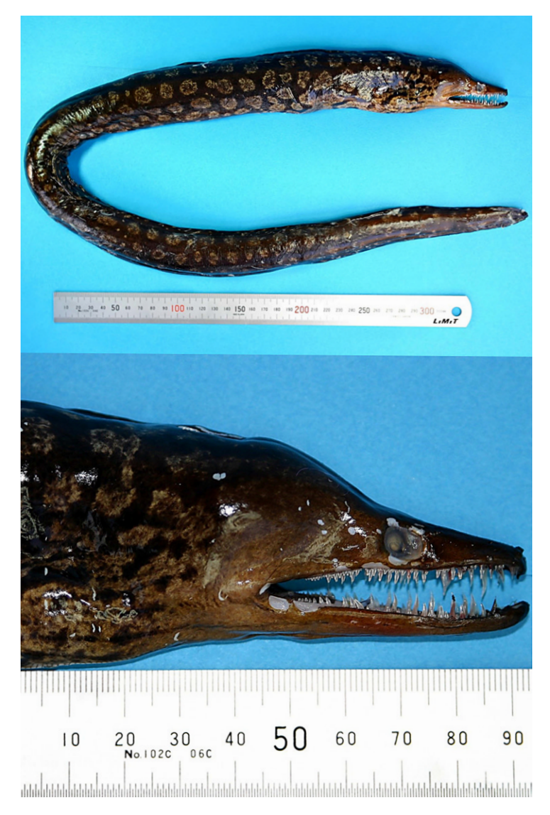
Fig. 2: The fangtooth moray Enchelycore anatina captured at Kolimbia bay, Rhodes Island on the 13th of April 2010 (Photos: Stratos Koufos).

the Nile River inhibiting the westerly expansion of species (RILOV & GALIL, 2009). The rate of introductions into the Mediterranean has increased over the last decade and it is estimated that there is one new introduction every 9 days (ZENETOS et al. , 2008; ZENETOS, 2010). Continuous mon-