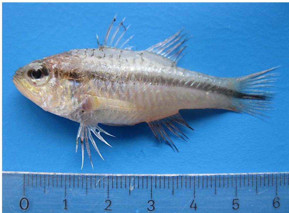
Fig. 2: Apogon fasciatus (White, 1790) from Iskenderun Bay, Turkey.

the depth range of 2-128 m (LIESKE & MYERS, 1994; FROESE & PAULY, 2010). A. fasciatus reaches the size of 10.3 cm and feeds on zooplankton (RANDALL, 2005; GOREN et al. , 2009).